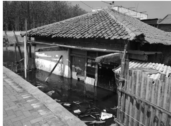
Picture 1. Houses Submerged by Tidal Flood in Terboyo Kulon

Source: Researcher's documentation, August 2, 2018