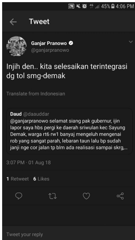
Picture 3. Screenshot of a text message on Twitter

Source: Researcher documentation, August 1, 2018