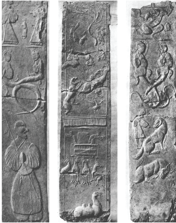
Figure 7: Eastern Han tomb from Xinye Libu, Nanyang. Second century CE. Eastern Han (After Jiang 2001, fig. 58).

Through a thorough examination of the representations of Fuxi and Nüwa and that of the sun and moon from the Han to the Wei-Jin periods, the present essay proposes four primary modes in terms of the ways in which the two pairs are combined. Each mode shows a particular development of the imagery that includes both the pairs in specific historical and regional contexts. In the first mode, the sun and moon appear besides Fuxi and Nüwa (Fig. 3). It is an “archaic” mode that was only found on ceilings of Western Han tombs from the then political and economic centre of the city of Luoyang (in today’s northern Henan), and was not inherited by later traditions. The second mode refers to the arrangement of the sun and moon held in hands by Fuxi and Nüwa respectively. It could be termed “standard,” as it is the most popular mode that has flourished through the long historical course of depicting Fuxi and Nüwa in a pair. In comparison to other modes, it is predominant in Nanyang (Fig. 8) and the Southwest (in today’s Sichuan and Chongqing) (Fig. 2) during the Eastern Han, as well as the Hexi Corridor in the Wei-Jin era (Fig. 5).