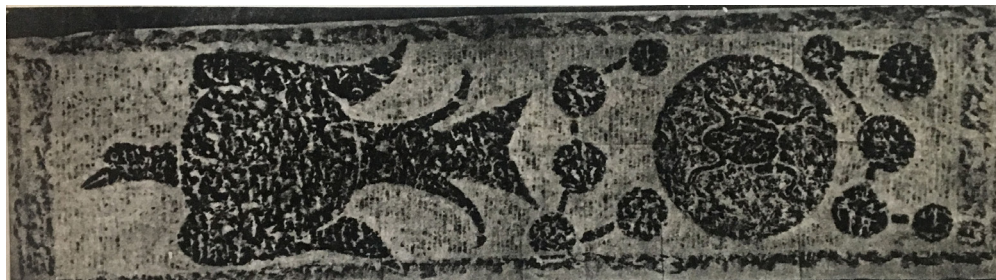
Figure 24: The sun and the moon from Nanyang, Henan. Second century CE. Eastern Han (After Wang and Shan 1990, fig. 280).