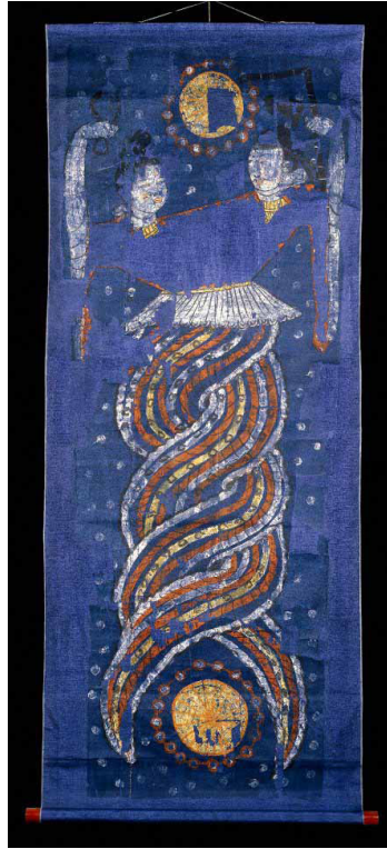
Figure 6: Fuxi and Nüwa from Astana, Turfan. Seventh to ninth century CE. Tang dynasty (After The British Museum, Museum no. 1928-1022-0.203 ).

However, the sun and moon are not always the standard attributes of Fuxi and Nüwa in the Han Dynasty, and sometimes are instead the compass and square (Fig. 1), which are spread across the country, or the auspicious plant lingzhi 靈芝 (Fig. 7), particularly popular in the region of present-day Shandong and Nanyang 南陽 (in today's Southern Henan). How were the pair of the sun and moon integrated into the imagery of Fuxi and Nüwa? What was the specific significance of the sun and moon to Fuxi and Nüwa? And how to perceive the sun and moon in the larger iconographic scheme of the Fuxi and Nüwa? Moreover, how does the combination of the two pairs function in the ritual and burial contexts? These questions remain insufficiently examined in current scholarship. 1