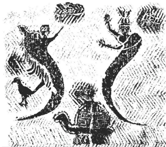
Figure 19: Fuxi and Nüwa on the no. 3 sarcophagus of the Guitoushan tomb. Rear end. Jianyang, Sichuan. Second century CE. Eastern Han (After Henan meishu chubanshe 2000, fig. 100).

Regarding the current debate on the identification of the two deities, I propose three additional perspectives. The first relies on epigraphical sources while the other two are based on the modes of depicting the sun and moon, as concentrated in this research. The most reliable evidence for iconographic identification actually entails inscriptions. Currently, all of the three Fuxi and Nüwa images bearing epigraphical references to the two deities are dated to the Eastern Han. They were found respectively on a stone sarcophagus from Guitoushan 鬼頭山 at Jianyang 簡陽, Sichuan (Fig. 19), on a pictorial panel from the Wu Liang Shrine 武梁祠 at Jiexiang 嘉祥, Shandong (Fig. 1), and on the ceiling of a tomb from Jingbian 靖邊, Shaanxi (Fig. 20) (Shaanxi sheng kaogu yanjiuyuan 2017). As all inscriptions were dated to the Eastern Han Dynasty, later than the Western Han tomb paintings in the Luoyang area, they are not sufficient to indicate a solid, exclusive connection between snake-like bodies and Fuxi and Nüwa in Luoyang tombs.