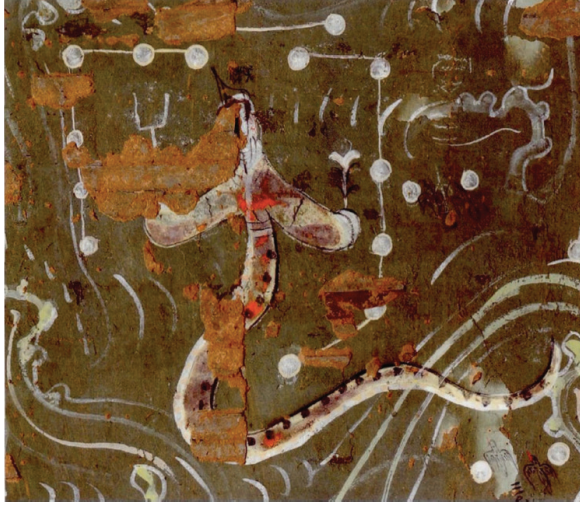
Figure 20: Fuxi in the celestial world. Jingbian, Shaanxi. Second century CE. Eastern Han (After Shaanxi sheng wenwu kaogusuo 2017, fig. 41).

Second, a thorough survey of the depiction of the sun and moon in connection to Fuxi and Nüwa in the Luoyang area indicates that previous scholarship is problematic in terms of distinguishing the imagery of Fuxi and Nüwa from that of Changyi and Xihe. Previous scholarship proposed an exclusive identification of the paired deities in the Bu Qianqiu tomb (Fig. 3), Qianjingtou tomb (Fig. 14, 15), and most of the Eastern Han tombs as Fuxi and Nüwa, while the pair in the Xincun tomb (Fig. 16) and the Daobei shiyouzhan tomb (Fig. 17, 18) were identified as Changyi and Xihe merely because of the distinctive ways how the sun and moon were depicted (Huang 1996). If based on the four modes identified in current research, the supposed Fuxi and Nüwa refers to the first mode while Changyi and Xihe to the second. However, this absolute distinction contradicts the fact that the second mode was also applied in other Luoyang murals that were identified as representations of Fuxi and Nüwa and dated to a period similar to the Xincun tomb and the Daobei shiyouzhan tomb. In addition, the identification in previous studies did not interpret the chronological sequence of the two modes. Why was the pair of Changyi and Xihe depicted later than Fuxi and Nüwa?