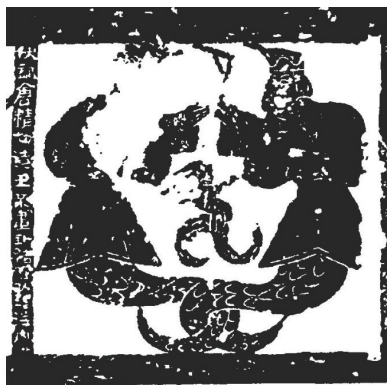
Figure 1: Fuxi and Nüwa at the Wu Liang Shrine, Shandong. Second century CE. Eastern Han (After Jiang 2000, fig. 49).

Fuxi 伏羲 and Nüwa 女媧 were among the most prominent deities in Chinese genesis mythology. Fuxi is best known as an ancestor of human beings, and Nüwa is the goddess who created human beings by moulding yellow earth together and patching the broken sky. In visual culture, Fuxi and Nüwa usually appear as a couple with human faces and snake-like bodies that are sometimes intertwined with each other. The couple was frequently depicted on chamber walls of ancestral shrines (Fig. 1), stone sarcophagi (Fig. 2), and the domed ceiling of tombs (Fig. 3) during the Han Dynasty.