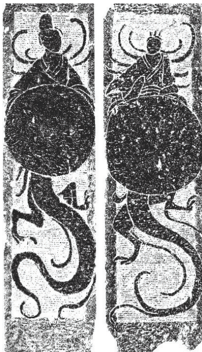
Figure 10: Fuxi and Nüwa from the Pictorial Stone Tomb at Qilin'gang, Nanyang, Henan. Second century CE, Eastern Han (After Huang et al. 2008, fig. 154).