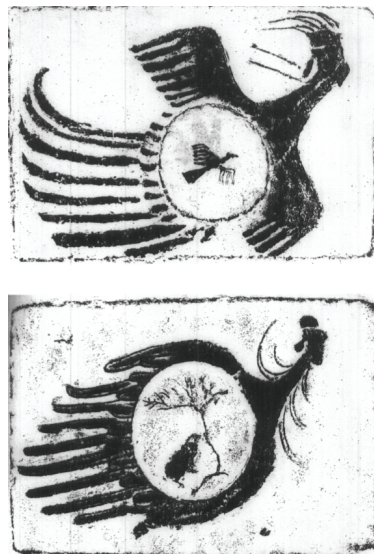
Figure 23: Sun God and Moon Goddess from the tomb of Xinfan, Sichuan. Second century CE. Eastern Han (After Gong 1998, figs. 346 and 347).