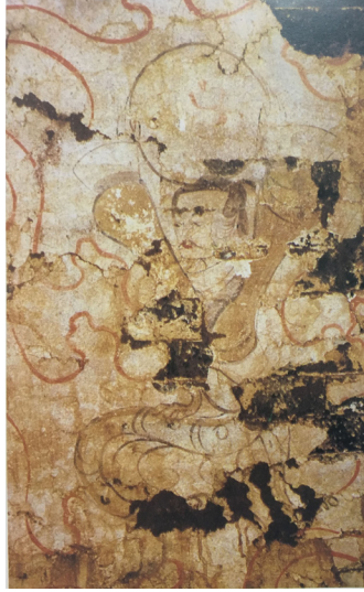
Figure 17: Changyi on the ceiling of the Daobei shiyouzhan tomb, Luoyang, Henan. Second century CE. Eastern Han (After Huang 1996, 148).