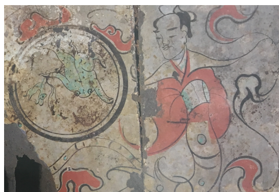
Figure 15: Nüwa on the ceiling of the Qianjingou tomb, Luoyang, Henan. First century BCE. Western Han (After Huang 1996, 85).