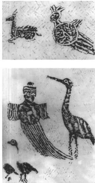
Figure 21: Sun God and Moon Goddess on No. 4 and No. 5 tomb of Guitoushan, Jianyang, Sichuan. Second century CE. Eastern Han (After Gong 1998, figs. 348 and 349).

Besides being depicted in association with the imagery of Fuxi and Nüwa, the sun and moon have already been widely represented in a variegated range of pictorial contexts. An examination of the visual tradition of depicting the two celestial bodies during the Han and Wei-Jin period reveals an idiosyncratic phenomenon in the Southwest: the appearance of the anthropomorphic rendering of the sun and moon as a pair (Fig. 13, 21, 22, 23). A further inquiry indicates that the formation