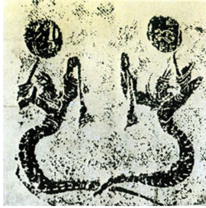
Figure 2: Fuxi and Nüwa on the stone sarcophagus found at Baozishan, Xinjin, Sichuan. Ink rubbing. Second century CE. Eastern Han (After Gao 1998, fig. 202).