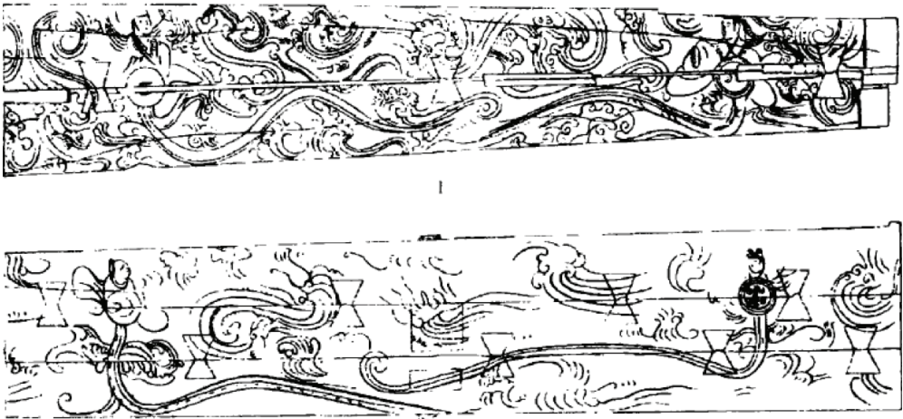
Figure 12: Fuxi and Nüwa on the coffin cover of the M1 Tomb from Jiayuguan, Gansu. Third century CE. Wei-Jin period (After Zhao 2005, fig. 1).

Further iconographic analysis of the four modes within their contexts sheds light on revising issues remaining unclear in the identification of Fuxi and Nüwa. The two deities depicted in the first and second modes in Luoyang area