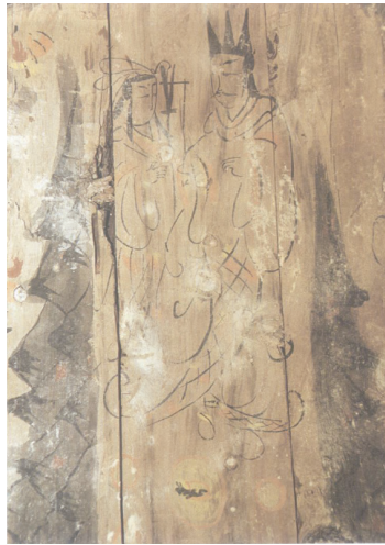
Figure 4: Fuxi and Nüwa depicted on coffin cover from Maozhuangzi, Jiayuguan, Gansu. Third century CE. Wei-Jin period (After Kong 2006, fig. 14).

cover wooden coffins (Fig. 6) (Deng 2010; Chen 2011). The union of Fuxi and Nüwa is considered like a diagram of yin 陰 and yang 陽, the two universal forces in the cosmology of the time, according to their different genders and the usually intertwined bodies of the couple (Birrell 1993; Lewis 1999, 204; Wu 2012). In addition, the depiction of the sun and moon is generally considered a coherent visual component of the Fuxi and Nüwa imagery, appearing in the shape of round discs that contain a toad in the moon and a three-legged crow in the sun, respectively, since the Han Dynasty (Fig. 2, 3), while an abstract depiction of the sun with radiating beams inside and the moon in the crescent shape became dominant in Tang burial arts of the Hexi Corridor (Fig. 6).