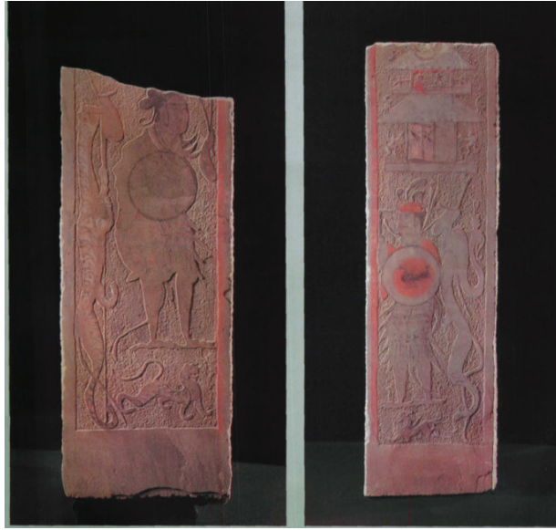
Figure 11: Fuxi and Nüwa embracing the sun and the moon. Han tomb at Dabaodang, Shenmu, Shaanxi. Eastern Han (After Shaanxi sheng kaogu yanjiusuo 1997, figs. 1 and 2).