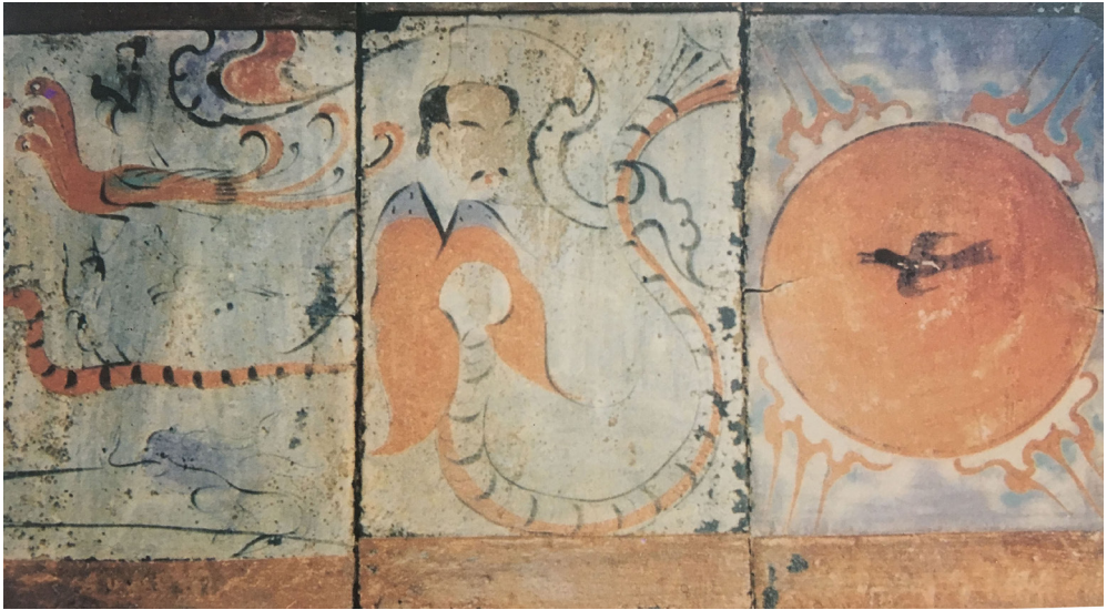
Figure 3: Fuxi and the sun on the ceiling of the tomb of Bu Qianqiu, Luoyang, Henan. 86 BCE–49 BCE. Western Han (After Huang 1996, 73).

When it comes to the Wei-Jin 魏晉 tombs dated from the third to fourth centuries CE, the couple frequently appears on the covers of wooden coffins (Fig. 4), or pictorial bricks on tomb walls (Fig. 5). In the Tang Dynasty from the seventh to the ninth centuries, most of the depictions of the couple have been discovered at Turfan 吐魯番 in the Hexi Corridor 河西走廊, in the form of silk paintings that