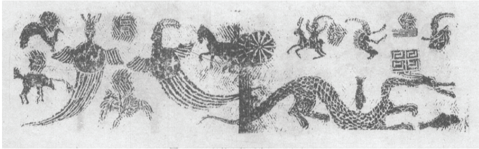
Figure 13: The sun and moon on the no. 3 stone sarcophagus from Guitoushan, Jiayang, Sichuan. Second century CE, Eastern Han (After Neijiang shi wenguansuo 1991, fig. 11).

appear to be more closely related to the legend of Changyi 常儀 and Xihe 羲和, who were recorded as attendants of the sun and moon, instead of Fuxi and Nüwa. It discloses that the third mode, which has the sun and moon embraced by Fuxi and Nüwa, has exerted influence on the imagery of the sun god 日神 and moon goddess 月神, the anthropomorphic forms of the sun and the moon, in the Southwest region (Fig. 13).