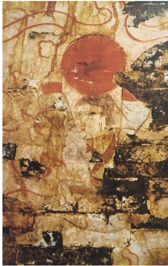
Figure 18: Xibe on the ceiling of the Daobei shiyouzhan tomb, Luoyang, Henan. Second century CE. Eastern Han (After Huang 1996, 147).

Nevertheless, this claim requires further discussion as it touches an issue that has been mentioned in some research but not yet addressed in detail: whether it is the