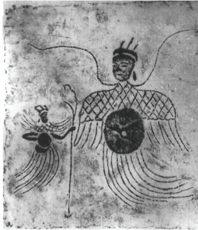
Figure 22: Sun God and Moon Goddess from the tomb of Zhaojue Temple, Chengdu, Sichuan. Second century CE. Eastern Han (After Gong 1998, fig. 345).

of the sun and moon in anthropomorphic representation in the Southwest incorporated two visual traditions: that of Fuxi and Nüwa in local tradition, since the sun and moon appear in anthropomorphic form with a rendering of their heads and faces almost identical to that of Fuxi and Nüwa, and that of the sun and moon in Nanyang, where we see the prototype of the Southwest composition for locating the sun and moon as part of a flying figure's body (Fig. 24 and 25).