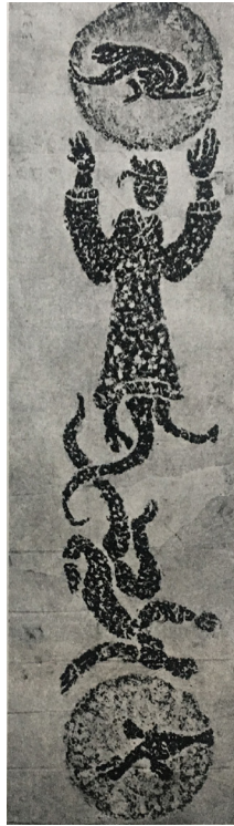
Figure 8: Fuxi and Nüwa from Tanghe Huyang, Nanyang, Henan. First century CE. Eastern Han (After Nanyang shi bowuguan 1981, fig.158).

The third mode depicts the sun and moon as embraced in front of the chest of Fuxi and Nüwa. It was applied occasionally during the Han Dynasty in Shandong/Jiangsu (Fig. 9), Nanyang (Fig. 10), and Shaanxi (Fig. 11), but not in the Southwest. During the Wei-Jin period, it became the predominant mode that was depicted on the surface of wooden coffins (Fig. 12) or pictorial bricks used in burials of the Hexi Corridor. Last, the fourth mode depicts the sun above Fuxi and Nüwa while the moon below (Fig. 6), naturally in a vertical setting. Although it was applied primarily to silk paintings found in burials dated to the Tang from the seventh to ninth centuries, later than the time range of the current research, I include it since its prototype already appeared in the Wei-Jin era.