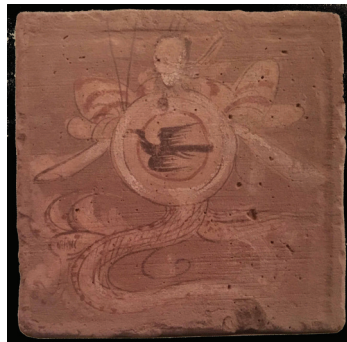
Figure 5: Pictorial Brick from the Dunhuang Museum. Dunhuang, Gansu. Third century CE. Wei-Jin period (After Dunhuang Municipal Museum 2017, 12).