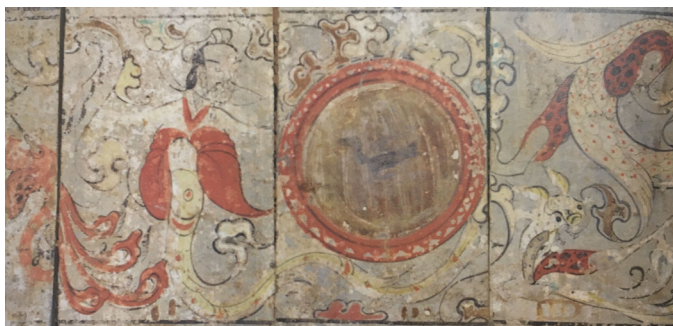
Figure 14: Fuxi and the sun on the ceiling of the Qianjingou tomb, Luoyang, Henan. First century BCE. Western Han (After Huang 1996, 82).