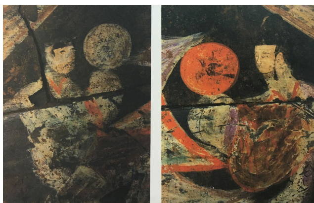
Figure 16: Fuxi and Nüwa of the Xincun tomb from Yanshi, Henan. First Century CE. Xin-Mang period (After Huang 1996, 126).