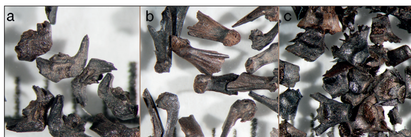
Fig. 4. Most frequent macroremains from the loom-weight cereal by-products. a emmer spikelet forks; b glume bases; c barley rachis fragments.

Although in both cases of sampling, the researched material was waterlogged and clayey, the state of