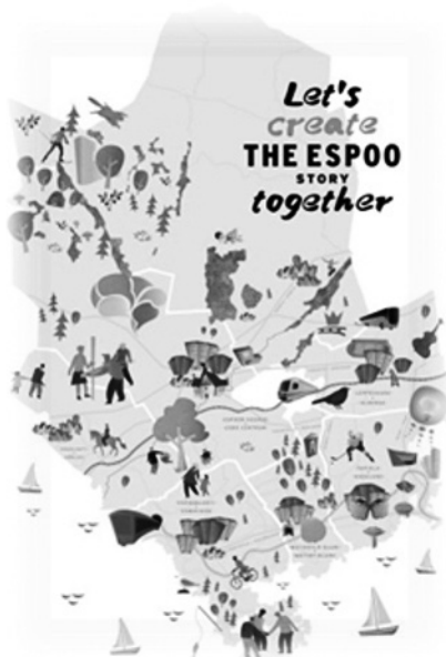
Figure 1: The Espoo Story was created together with citizens and stakeholders