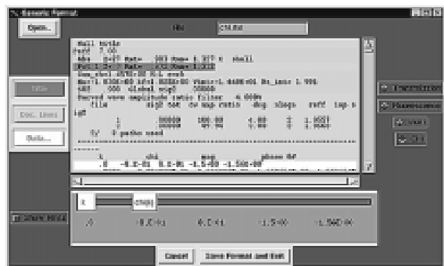
Figure 2 IRIX 6.5 version of the generic format card.

As mentioned before, APEX 2.0 offers much more than just incremental improvements. A screenshot of the generic data conversion card is shown in Fig 2. The user selects title, documentation and data lines by clicking the appropriate color buttons (colors are user configurable). Then the user selects the type of conversion.