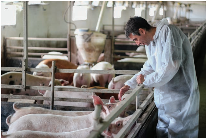
Figure 4. Photo of an animal care taker interacting with growing pigs.

Another reason we generally see it as insufficient is that technological fixes do not replicate an actual relationship where the dependent being known is being cared for (Figure 4). Food being distributed in a feeder is different than the food being found by the animal or given to it by a human companion. It feels to some of us that using technology in place of building an actual relationship of care is a dereliction of a duty to build that very relationship. As we have discussed at multiple points, it is likely impossible to discharge these duties on a large-scale feeding operation. But if it is true that these duties exist, telling ourselves that PLF technologies do the job just as well or better, and that we can still have the romantic idea of a caretaking farmer is perhaps false. In that case, they would be more of a poor substitute in a bad situation than they are a fix to the problems in the first place.