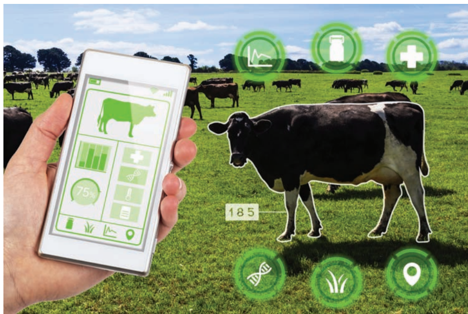
Figure 2. Potential use of apps for smart phones or other hand-held devices to monitor the health and well-being of individual animals on the farm.

It is true that the jobs which remain may well be less physically demanding and safer, as well as the addition of at least a few technical jobs to operate PLF equipment. However, farm labor and jobs with a connection to food production are often seen as particularly important (Thompson, 2010, 2017), and their