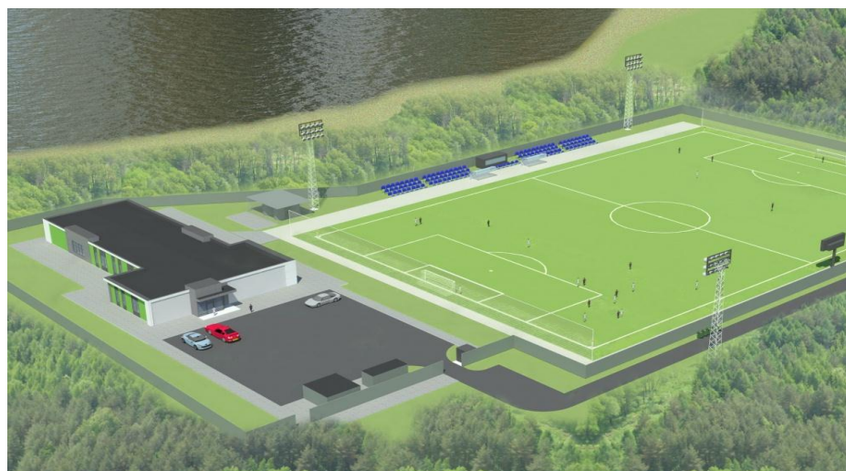
Figure 1. Sports field for field hockey [2].

The purpose of the work is an environmental-economic assessment of the changes that have occurred as a result of the reconstruction of the sports ground in the park.