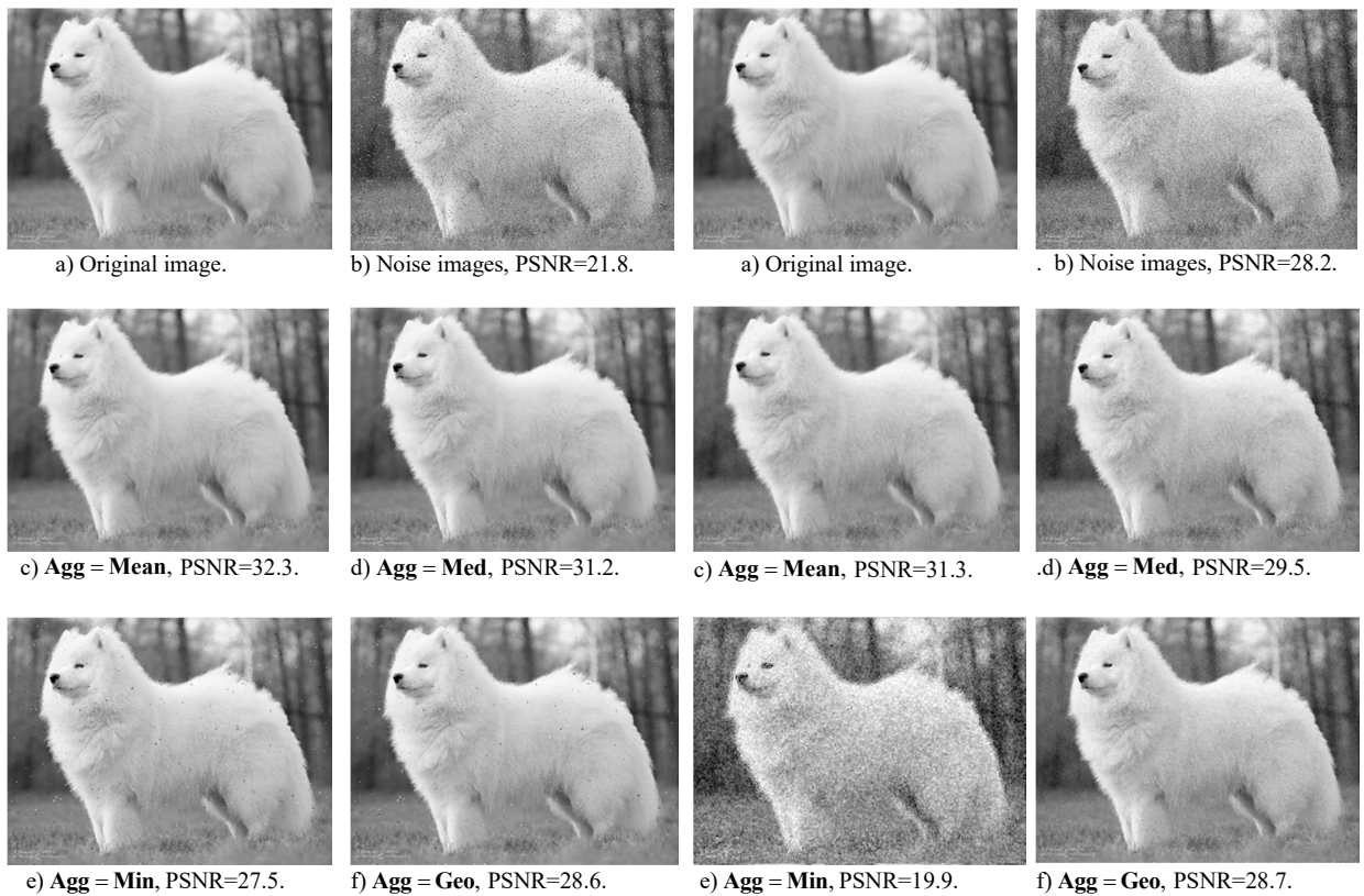
Fig. 2. Original (a) and noise (b) images. Noise: “Salt-Pepper PD”. Denoised images (c)-(f).