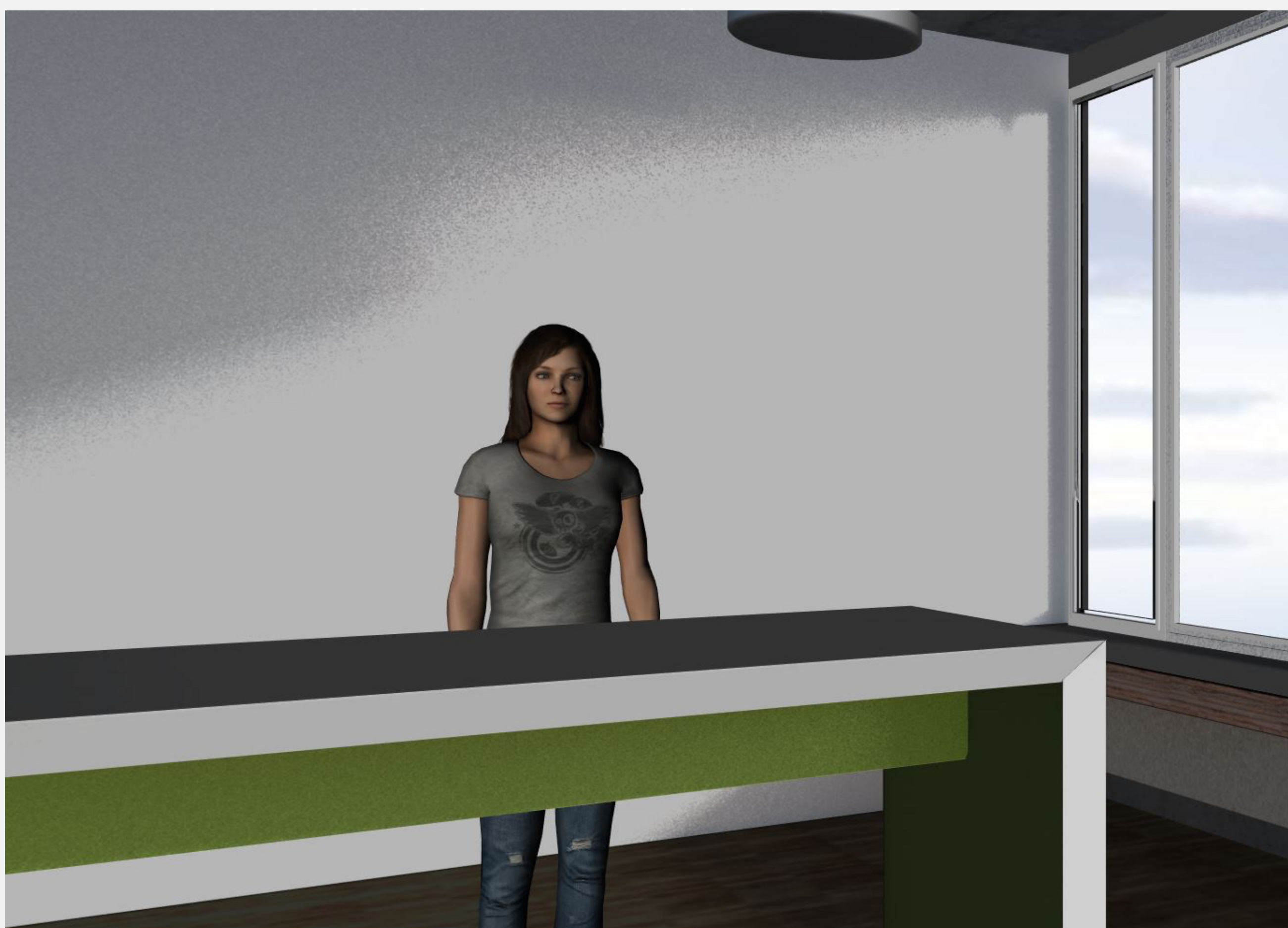
Figure 1: Participant's 3D view in the IVR with avatar who listens to the explanation. The virtual environment was rendered using the Worldviz Vizard (version 5.0) and presented by means of a Oculus Rift Head-mounted display.