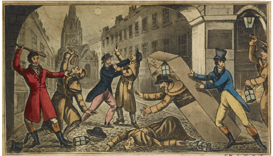
Figure 5: ‘Tom Getting the Best of a Charley’, Pierce Egan’s London Life used the literary trope of the camera obscura to portray the rapidly changing city from a detached and safe viewpoint. (© British Library Board, 838.i.2., opp. page 232).

Beyond its function as a visual apparatus, the camera obscura’s view from interior to external world provided a device for the writer and reader to imagine life in the city. To observe in this way depended on the body’s presence, mediated by the interior space of the camera, to create a distance between subject and object. The voyeuristic relationship represented in Egan’s account showed how the interior viewpoint of the device provided a view of the city, in which the position of the observer was recognised, separate and unseen.