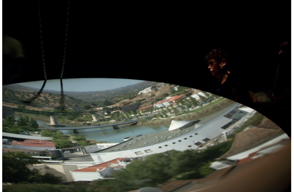
Figure 2: the camera obscura's dark interior creates an eerily detached sense of the silent city below.

The town of Tavira in Portugal is overlooked by a water tower, now disused, its empty tank repurposed as a camera obscura [Figure 1]. High above the heat of the winding streets, I enter the converted cistern, plunged suddenly from bright sunlight into the dark shadow of the chamber. It is cold inside, and as my eyes adjust, I can just make out a large circular disc in the centre, watched by a dozen other people gathered around its darkened surface.