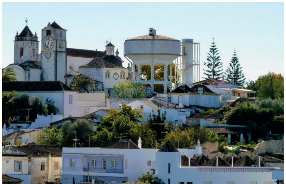
Figure 1: converted water tower, Tavira, Portugal, 'seeing without being seen'.

In this instance, interior is explored through its connection with the photographic image, examining how spatial engagement with the city through the camera obscura enabled a distancing between subject and object that led to the interior being negated, subsumed into the image itself.