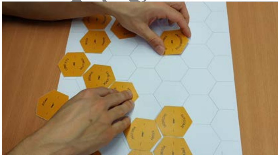
Fig. 4. Participant using the honeycomb board and cardboard pieces.

Discussion: Three Game design researchers and one game developer were invited to use the cardboard pieces (Fig. 4) while talking about games and the game development process (during individual interviews), as well as nine postgraduate students (during two focus groups). Among the nine ICT (Information and Communication Technologies) postgraduate students, six had moderately high or high level of experience in game programming and development; six had some or average experience in constructing game stories and narratives; and five had some or average experience in game art and animation. One participant had no experience in game art and animation, and one had no experience in stories and narratives.