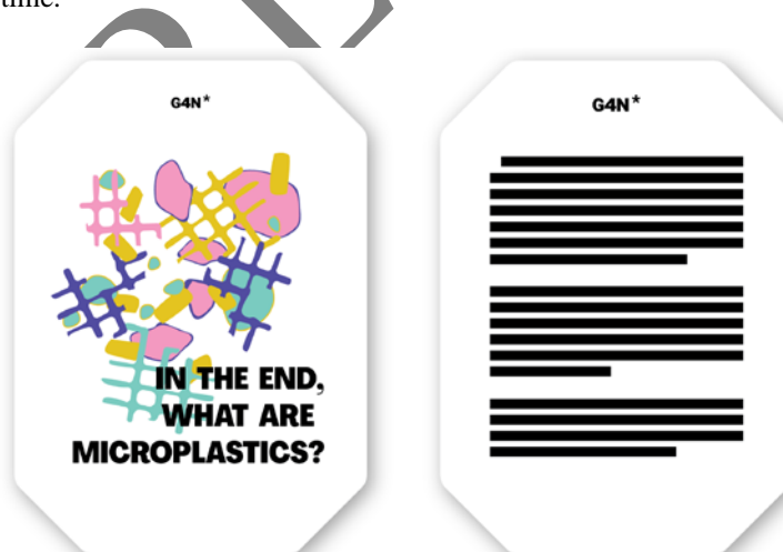
Fig. 7. Micro-plastics Cards Set

This card set is still in its prototyping phase, and therefore no tests have been made at the time.