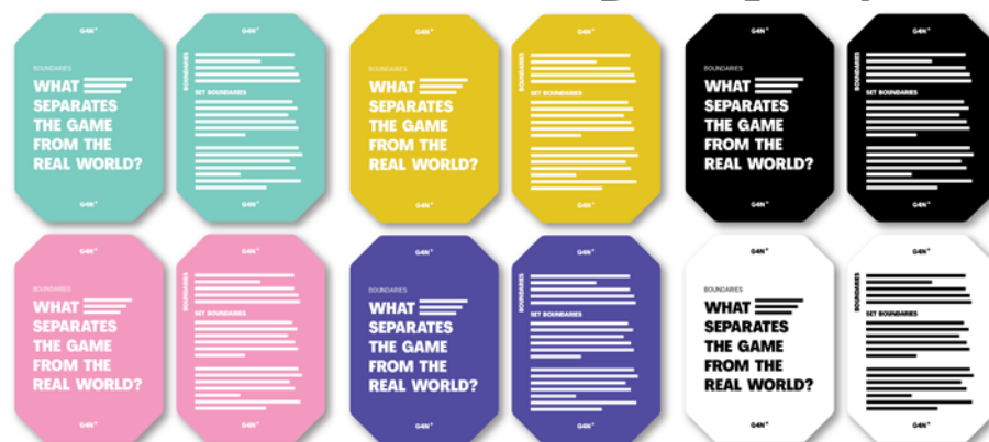
Fig. 6. The Game Construction Cards Set (cycle 2)

As in the previous stages, six sets of cards with different colours were developed. Each card addressed a game element, presenting in the front side the element's name, the trigger question and a brief description. In the back, the information was the same (with minor typo editions) showed in the previous cycle. As in this development cycle users would be challenged to create a game while using the cards, and in order to avoid any previous defined hierarchy or order, cards were no longer numbered (Fig. 6).