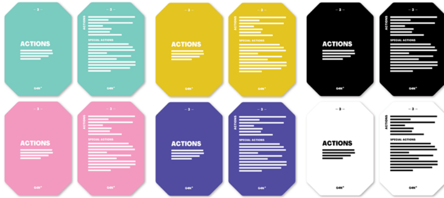
Fig. 5. The Game Construction Cards Set (cycle 1)

Discussion: End-users (the target audience, upper secondary and undergraduate students) were invited to evaluate the new Game Construction Cards Set prototype. This process of validation was made through four focus groups: two with target-group A (upper secondary students) and two with target-group B (undergraduate students). Students of target-group A were upper secondary students attending an ICT (Information and Communication Technologies) course, 11 students divided in two groups, 10 male one female, aged between 15-17 (average: 16), with no previous experience in game creation activities. Students of target-group B were undergraduate students also attending an ICT course, eight students divided in two groups; six males, 2 females, aged between 19-25 (average: 21), four had previous experience with game creation activities.