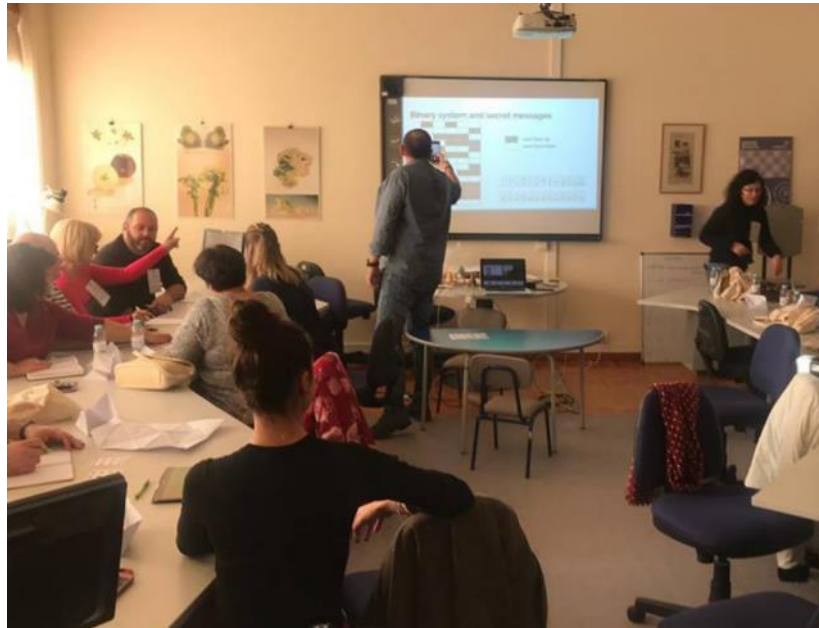
Figure 2 – Possible training scenario of the talk/workshop discussion