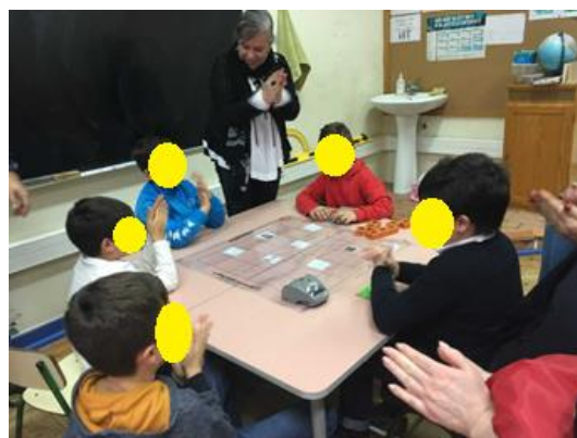
Figure 5– Possible training scenario of the peer-observation in a real school context

The following image(s) illustrate a possible training scenario for this session.