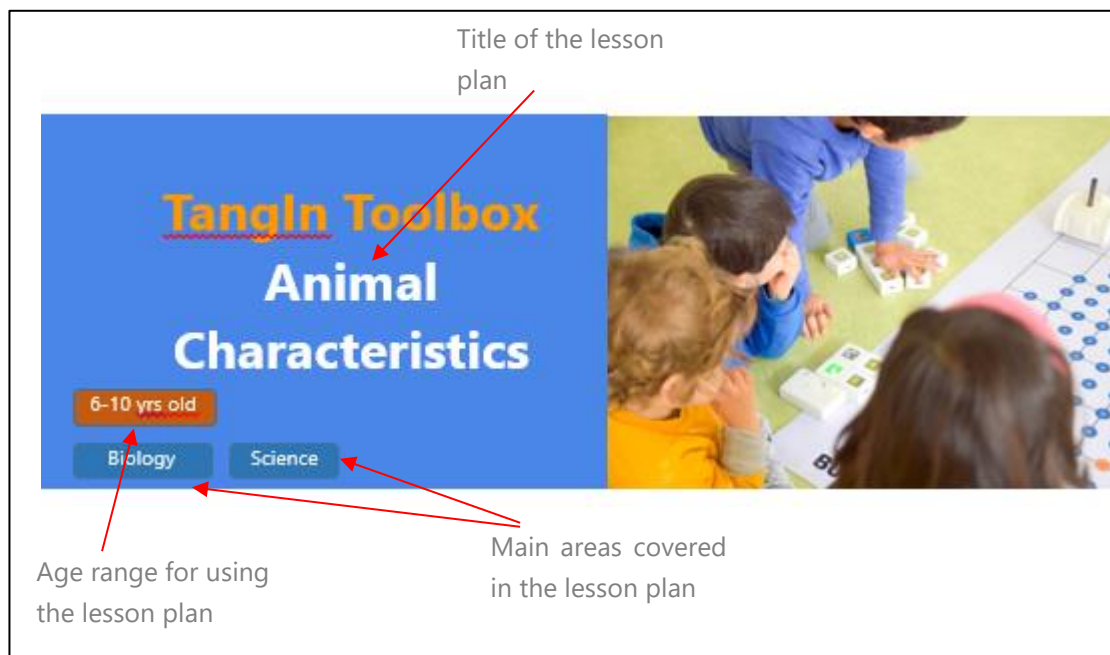
Figure 6 – Cover plan example of the TangIn toolbox

The following table presents a summary of the plans integrated into the TangIn toolbox and their links: