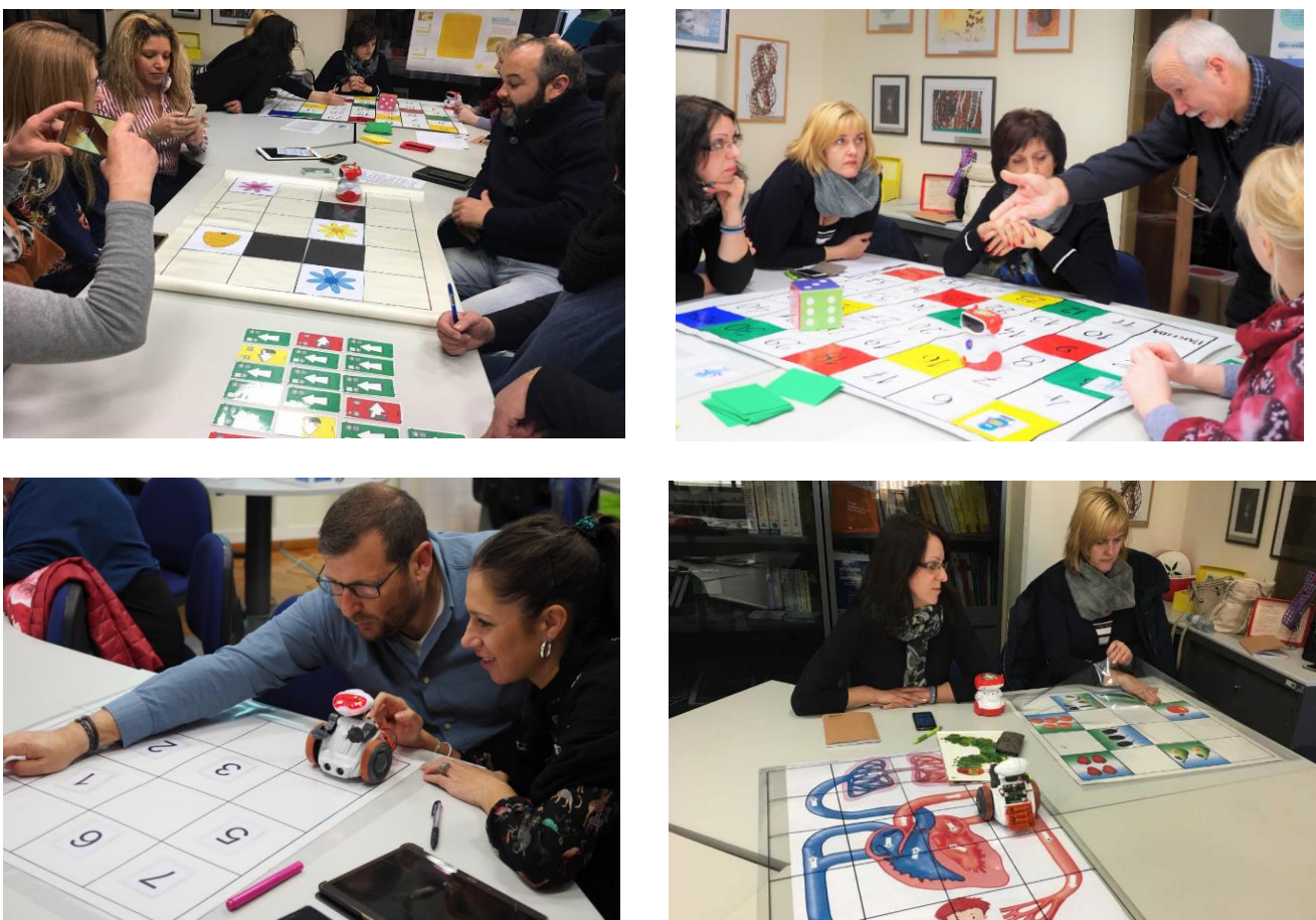
Figure 3 – Possible training scenario of the talk/workshop discussion

The following image(s) illustrate a possible training scenario of this session.