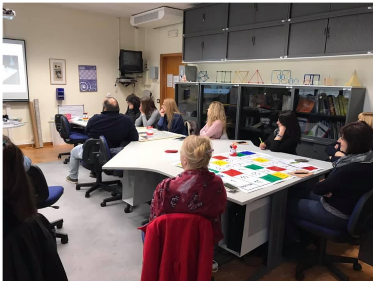
Figure 1 – Possible training scenario of a talk and group discussion