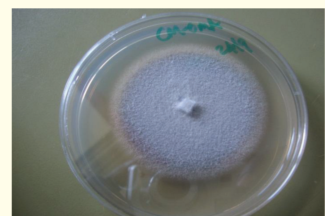
Fig 1. An eight day old culture of Magnaporthe grisea

A broad-based inoculation technique incorporating finger millet crop debris collected the previous season, infector rows, artificial inoculation and supplemental irrigation (Pande et al., 1995; Kiran Babu et al., 2013) was implemented. Inoculum was prepared from a single-spore representative culture of M. grisea isolated from blast infected samples collected from the finger millet fields in the previous season and cultured on oat meal agar (OMA) medium (Fig 1) (Kiran Babu et al., 2013) plus complete meal at 26±1°C for ten days. The spore suspension was adjusted to 1×10 5 spores/ml with the aid of a hemocytometer before inoculating the plants during the early evening hours on twenty day old seedlings and at pre-flowering.