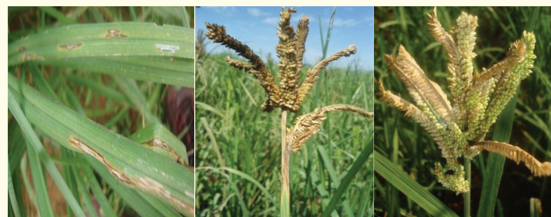
Fig 2. Leaf blast, Neck blast and Finger blast symptoms