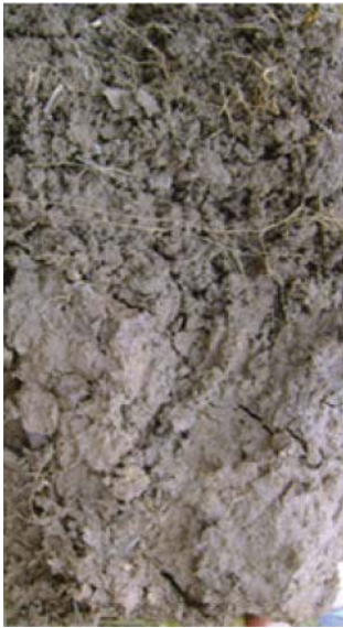
Figure 2: Structure of undisturbed soil