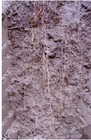
Figure 3: Biopores and roots permeating the pores in undisturbed soil

crops.) So, fewer disturbances and more mulch lead to more earthworms, the activity of which results in a better soil structure. Besides plant remains as food, the lime content of the soil is also important, therefore lime-free soils should regularly be supplemented with lime, or else biological processes will deteriorate, which has an adverse effect on the activity of earthworms.