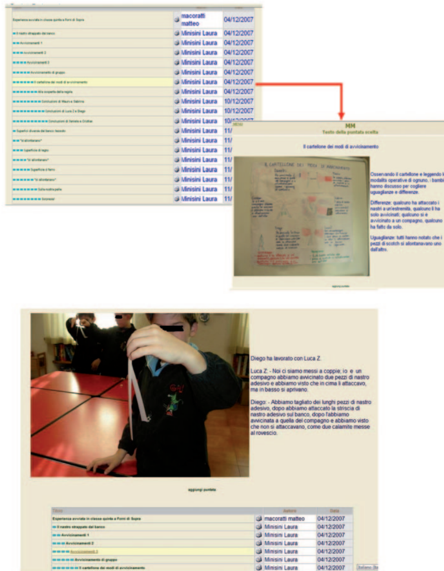
Fig. 3. – Structure of the MM tool: steps of the experience and opening of one step containing a poster built by 11 years pupils (top) and a step showing class activities (bottom); teacher: LM.