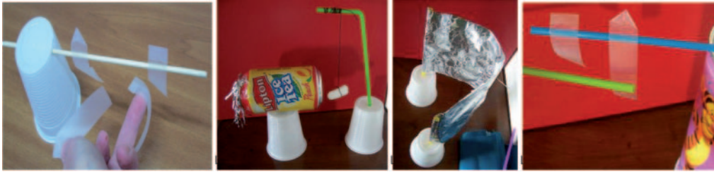
Fig. 2. – Some experiments in the path experienced by teachers.

charged/activated; the acquired property has a dual nature, and systems interact attracting or repelling each other according to the concordance or discordance between these properties. The proposed exploration of ways of charging (by pulling, by rubbing, by contact, by induction) was aimed to recognize that the charging process is an activation, is due to something that is in the material before charging, entities preserving themselves and mobile (see fig. 2).