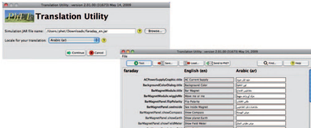
Fig. 2. – It shows the two windows of the Translation Utility. A. The upper left depicts the initial window where the translator chooses their locale. B. The lower right window shows the working window where the translator enters their translated text into the text boxes on the right side of the screen.

2.2. Simulation translation utility. – It may appear that the contributor model is a cost efficient option; however, professional software developers are quite expensive, it took them 180 hours to create the translation utility. Much of this time was figuring out the most efficient design. Here we will describe much of what we learned through this process in an attempt to save another group time during the development stage. In addition to the actual utility, each sim has to be “internationalized” by creating string variables (Malley, 2009).