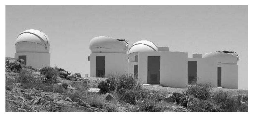
Fig. 1. - The six PROMPT enclosures at CTIO as of January 15, 2005.

PROMPT's six imager design (counting the polarimeter) will allow the u'g'r'R<sub>c</sub>i'z'JH SFD of the afterglow to be reconstructed, modulo a small, calibration-induced slope when non-photometric, after only two, mostly redundant exposure sets—regardless of potentially great variations in the early-time light curve—simply by repeating (preferably long-wavelength) filters across consecutive exposure sets: With only two cameras at least seven exposure sets would be needed, and with only one camera this would not be possible until after the afterglow settled into an easy-to-model behavior. From the reconstructed SFD the redshift of the GRB can be estimated from dropout, and because of the eightband coverage the dropout signature can be distinguished from the similar but broader signatures of extinction by dust, both in our galaxy and in the host galaxy, using the