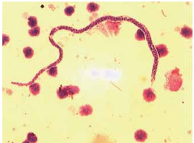
Figure 1. Mansonella perstans nematode in peripheral blood mononuclear cells from Buruli ulcer patient in Ghana. Cells were stained with Giemsa (original magnification \times 1,000 ). M. perstans nematodes can be distinguished from Loa loa and Wuchereria bancrofti nematodes by relative small size, detection in blood samples obtained during the day, and lack of a sheath.

All 66 patients completed RS8 treatment, but 9 were lost to follow-up during the 12-month follow-up period. Buruli ulcer lesions healed completely in 14 co-infected patients by 58 weeks (median 20 weeks, 95% CI 14.6–