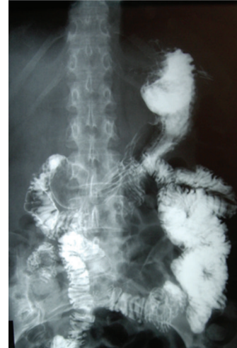
FIGURE 3: Upper GI shows the relief of obstruction by contrast moving distally, once the patient was placed in prone position.

During her surgical follow-up visit she continued to complain of postprandial pain with an early satiety and episodic nausea. She appeared weak and malnourished. She noted a 20 lbs weight loss since her initial antireflux procedure. Her abdomen was slightly distended with hyperactive