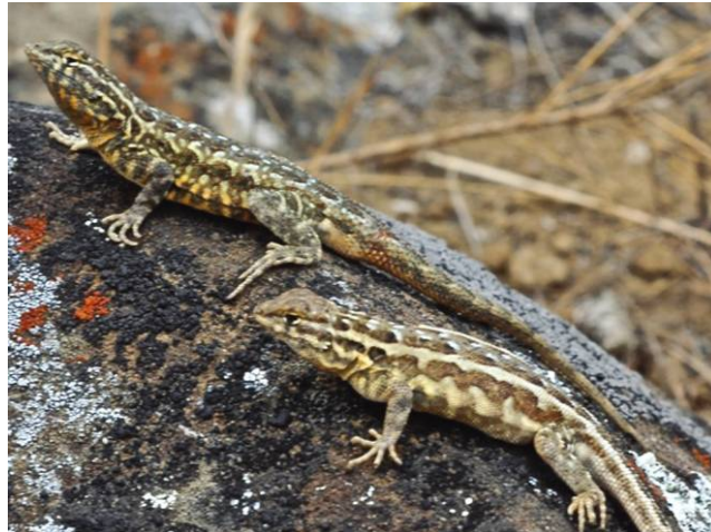
Male and female side-blotched lizards ( Uta stansburiana).