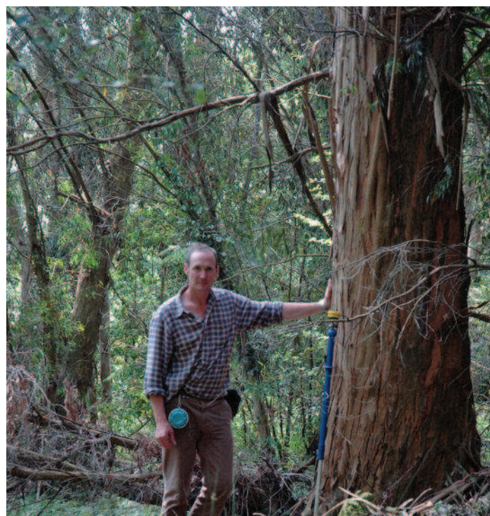
E. nitens 29 yrs old

The survival of the origins classified as E. johnstonii was significantly poorer than that of E. subcrenulata , while differences in basal area and height were not significant. It is also noteworthy that the dimensions of the surviving trees