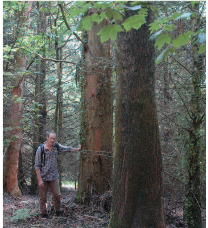
E. delegatensis 29 yrs old.

Certain seedlots and individual trees in the trial grew very rapidly over a period that equates to a relatively short rotation and have survived a number of severe winters and thus appear well-adapted to the Exeter site. If such growth could be obtained consistently and on a significant scale, these origins would clearly be of interest for production forestry. The good performance of seedlots from certain single-tree collections strongly indicates that a considerable part of the explanation for this performance is the genotype of the trees concerned. The results of the trial presented here indicate that bulk seed of any provenance of any species examined could not be recommended for larger-scale deployment. As examples, contrasting performance of progeny from single mother trees of E. subcrenulata from the same location on Mt Cattley, and of seed origins of E. delegatensis from Ben Lomond, indicate the risks of using bulk seed from identified provenances. However, collections in Australia from superior trees from these provenances could provide well-adapted, genetically diverse material for trial plantings in Britain. These trials could later be converted into seed production stands. Parts of the Exeter trial itself could also be used for seed