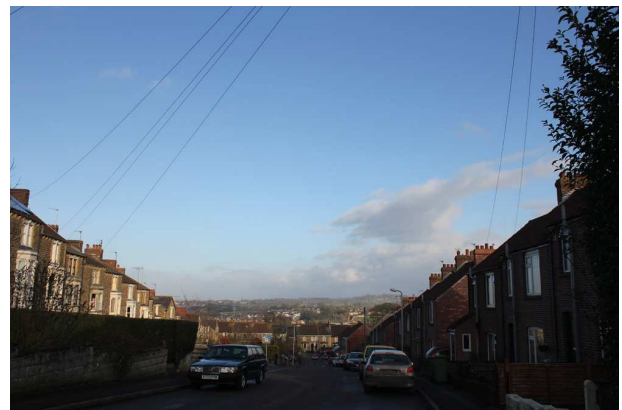
Figure 2a: A photograph of a view in Frome, Somerset, United Kingdom

The terrain model has a 2m posting from the original LIDAR information, and hence houses appear rounded, but the photography has a resolution of 12.5cm, which provides more visual detail. This helps distinguish the individual shape of the houses and is an important step towards the user being able to recognise their location. One limitation of this technique is that the photography is taken from a birds-eye view, and hence the sides of buildings display a stretched view of the roof, as opposed to windows and doors. Also, cars that feature in the photography aren't present in the terrain information, so they appear flat.