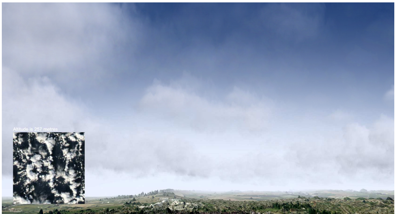
Figure 4: Another image from the 3D Weather prototype.