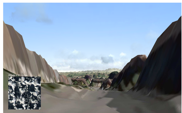
Figure 2b: 3D Weather representation of the same scene (but not with the correct clouds).