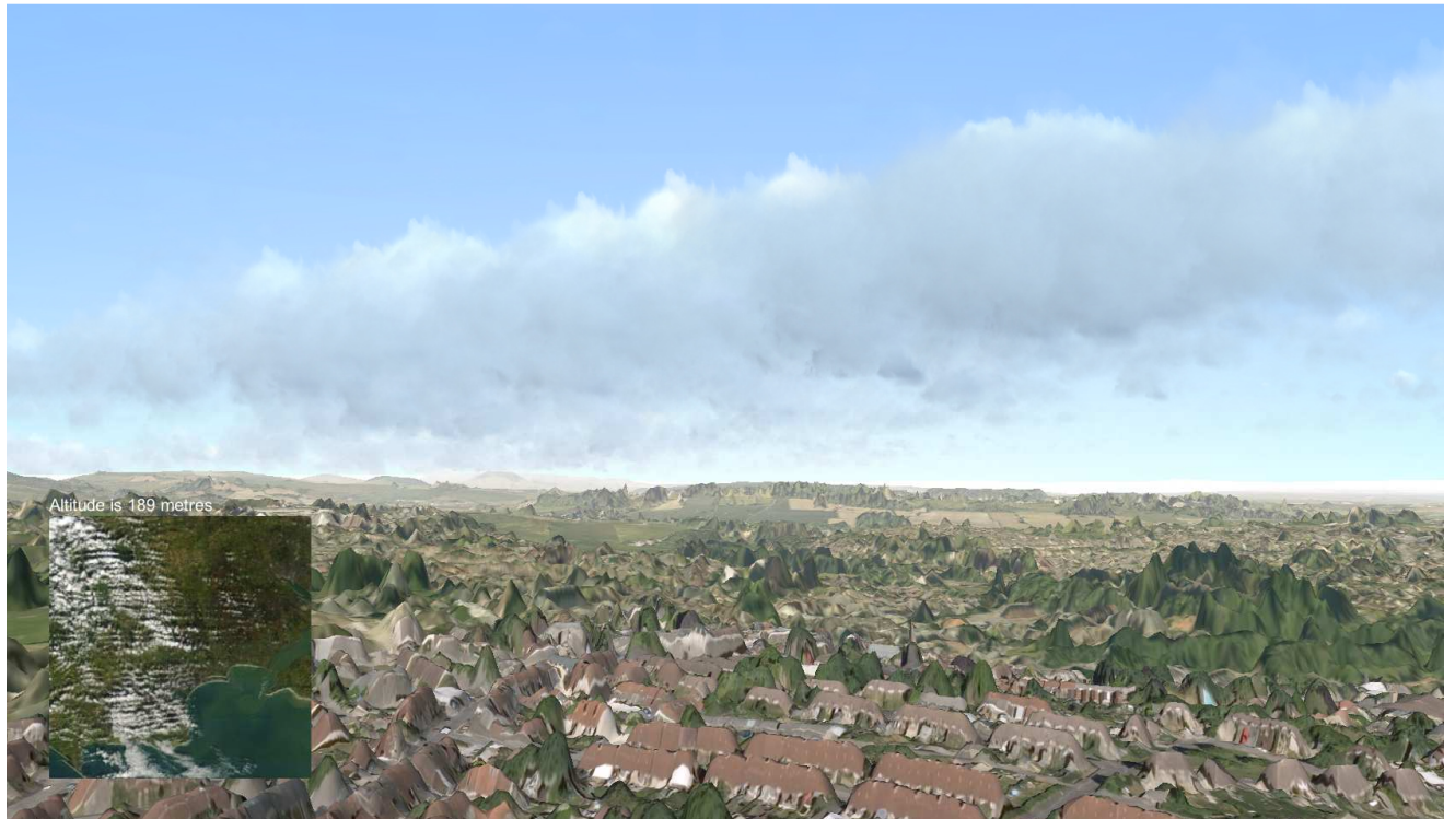
Figure 3: 3D Weather prototype showing terrain, clouds and a sample satellite image.