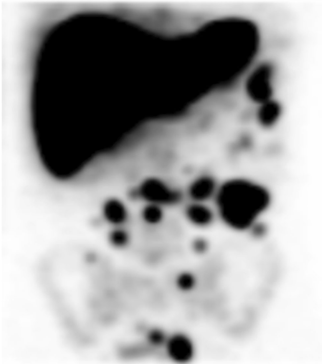
Fig. 2 Maximum intensity projection of SPECT giving an overview of the extent of disseminated splenosis within the abdomen and pelvis

highly specific scintigraphy, and invasive interventions were avoided. The patient was managed conservatively.