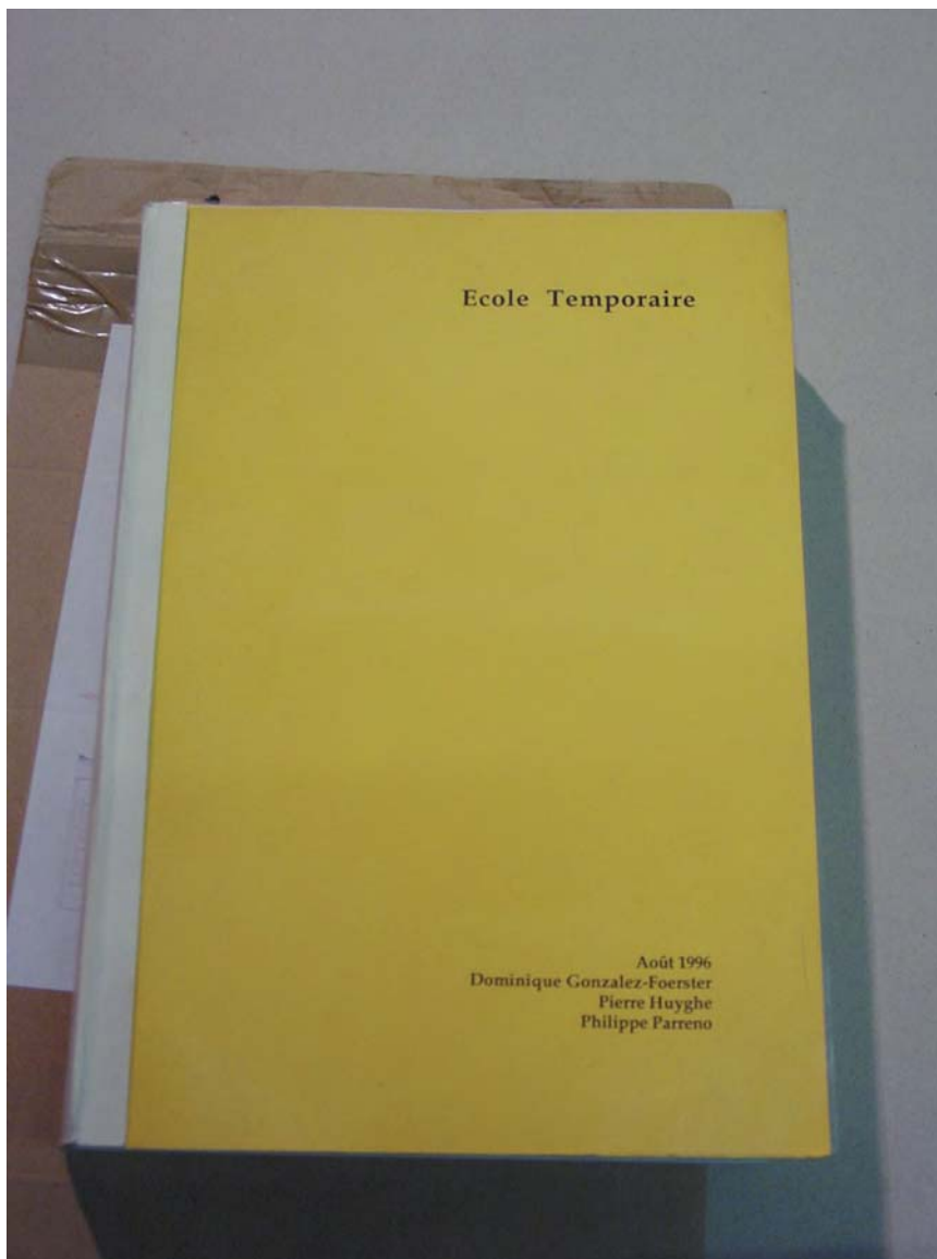
Figure 8. Pierre Huyghe. Temporary School . 1996. Manual. Collaborative project with Dominique Gonzalez-Foerster and Philippe Parreno.

image of the video for Temporary School , its manual (exhibited once) and a video (never shown). 23 That formal meetings and The House or Home? project never actually occurred is not a problem for Huyghe: "I can just say that it did, why not? It is enough for me to transmit a thought, an idea, a potentiality." 24 This revelation unveils the double layer of fiction at play in the Association's claims to hold meetings and execute projects, as well as to segregate their activities from economic capture. Perhaps this was precisely the point: the Association is a fiction,