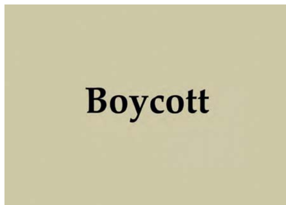
Figure 9. Pierre Huyghe. Le Procès du Temps Libre . 1999. The Boycott Party , postcard.

The first clue is a postcard with the large word “Boycott” across the center (Figure 9). The text on the back tells the story of Captain Charles Boycott, a land agent who in 1880 attempted to evict tenants who could not pay their rents. The artists propose a new holiday to celebrate Sir Charles, the first victim of “boycotting.” 33 Playing with the pun of the word “party,” the artists link the notion of a community, an association of people, to its formation through a party, a festive celebration. The Boycott Party aligns with Guy Debord’s view: