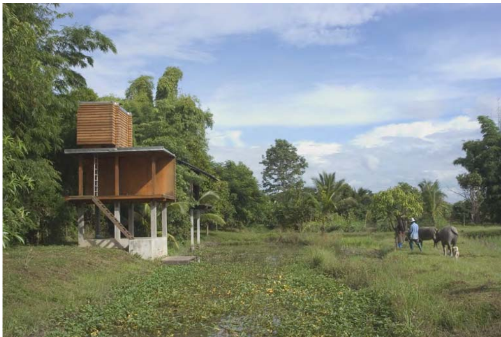
Figure 6. Rirkrit Tiravanija. The Land . 1998–ongoing. Photograph Liz Linden. Courtesy Rirkrit Tiravanija.

For the Association's second collaborative project, Temporary School (1996), artists Gonzalez-Foerster, Parreno, and Huyghe collaborated to produce a manual for a nomadic school and a video containing clips of their experiences with the students (Figure 8). The artists entered schools in Denmark, Sweden, and Paris, each time for three or four days, and used imaginative scenarios in the manual as starting-points for educational sessions. As in The House or Home? , the input of