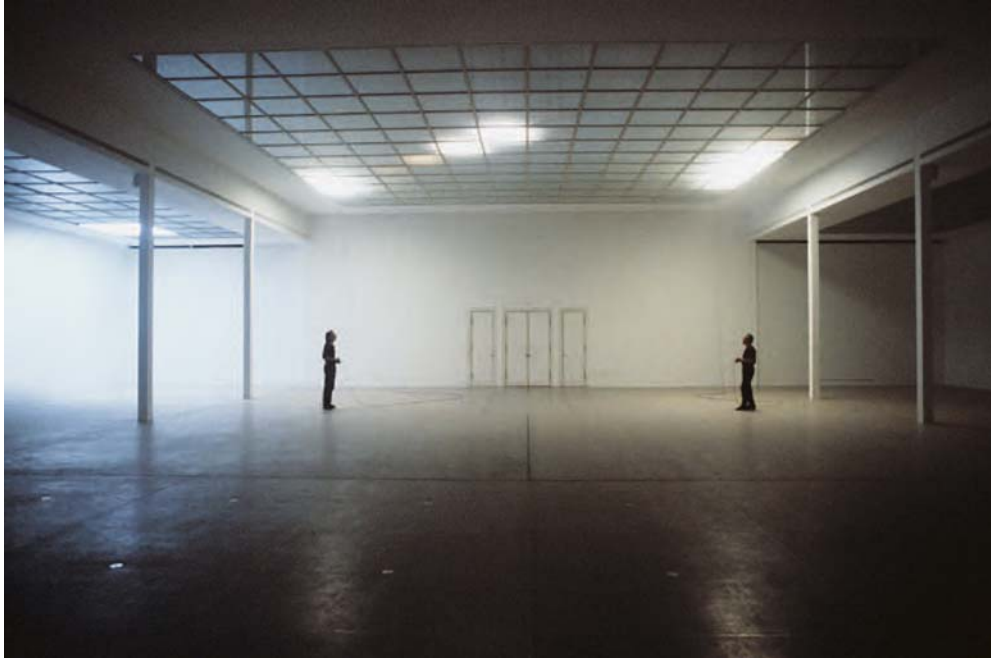
Figure 12. Pierre Huyghe. Atari Light. 1999. Computer game program, interface, joysticks, halogen lamps. Installation view, Secessions, Vienna.

self-construction is not inherently guaranteed within the capitalist work cycle. Parreno argues that even rest is productive and useful: “Rest allows the workforce to reconstitute itself . . . [it] is merely necessary for the pursuit of work .” Leisure is not “free time,” but a reified form of passive consumption. 43 Authentic “free time” – “the time in which we find ourselves” (Parreno) and “for constructing ourselves or our community” (Huyghe) – has been eroded by the annexation of rest and leisure to the service of industry. 44 Since time for oneself is no longer guaranteed within work, rest, or leisure, the artists established the Association to create this alternative time.