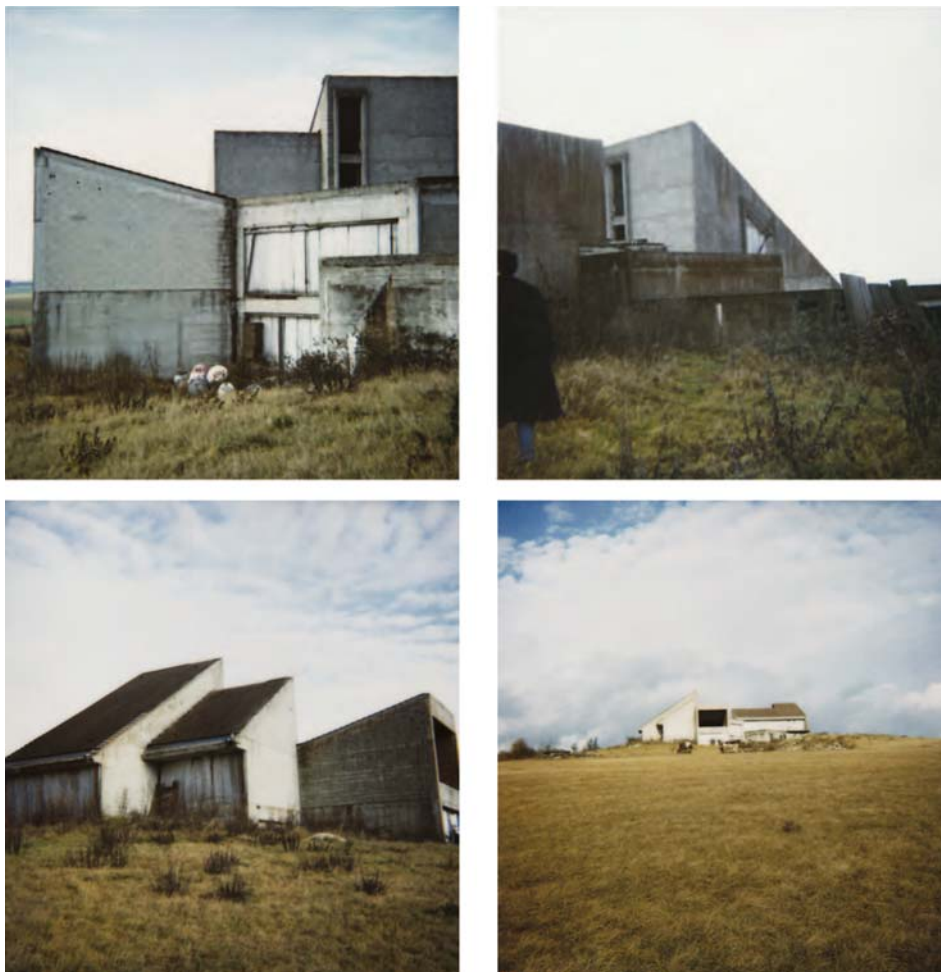
Figure 3. Pierre Huyghe. The House or Home ? (A.T.L.) . 1995. Residential project, unrealized. © Marian Goodman Gallery, Paris/New York.