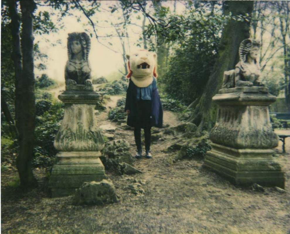
Figure 14. Pierre Huyghe. La Toison d'or. 1993. Event, Dijon. 15 Polaroids.