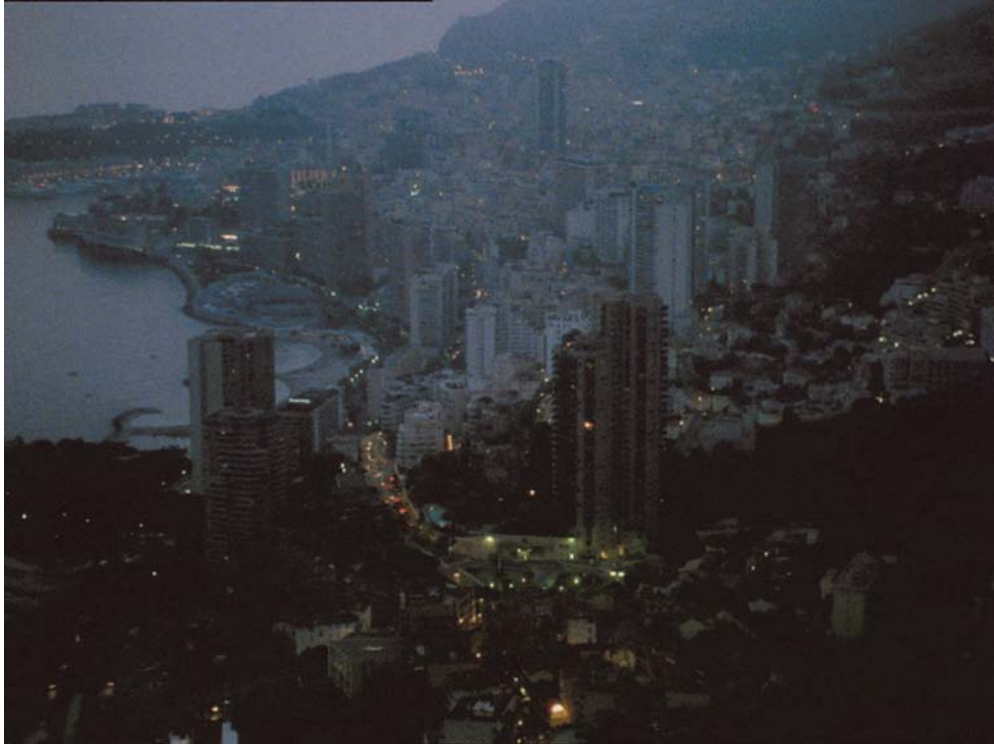
Figure 13. Pierre Huyghe. Vicinato 2 . 2000. Color film 35 mm, sound Dolby stereo, 15 mn, 2000. Production Anna Sanders Films.

artists' processes of work and non-work in fact produced forms of "immaterial production" — creating publicity, marketing, the engineering of ideas and social relations. The Association's so-called "unproductive activities" created new forms of exchanges and acts of alternative communication that are exactly the intellectual and cultural content of commodities produced by immaterial labor. 63