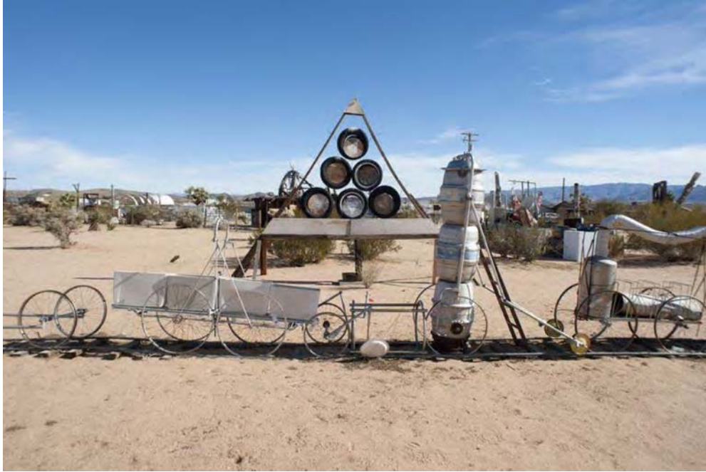
Figure 7. Noah Purifoy. Noah Purifoy's Outdoor Desert Art Museum . 1989–2004. Mixed media. 7.5 acres. Joshua Tree, California. Photograph Aurora Tang. Courtesy Andrea Zittel.

each artist shaped these participatory scenarios modeled on experimental schools including Black Mountain College in North Carolina, America and Summerhill School in Suffolk, England as well as fragments of science fiction texts and excerpts from avant-garde histories. 20 The project's nomadic and ephemeral nature, with the word "temporary" in its title, emphasizes the artists' privileging of time over fixed space. If The House or Home? was an early experiment with freed time that remained fixed to a site and accessible only to an exclusive group of artists, Temporary School liberated freed time from any site and furthered the potential for non-territorial communities.