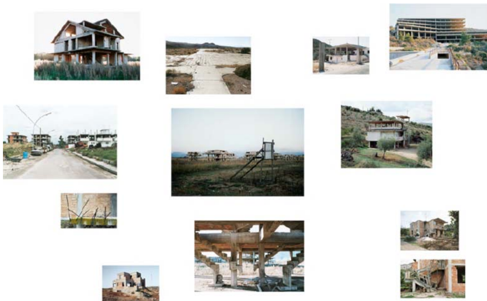
Figure 5. Pierre Huyghe. Chantier Permanent . 1993. Twelve photographs.

Huyghe is not alone in exploring collective living projects “outside” the spheres of art. Rirkrit Tiravanija's The Land (1998–ongoing) and Andrea Zittel's High Desert Test Site (HDTs) (2000–ongoing) are deliberately located in rural areas and the desert, respectively, because the artists perceive these sites as more open for experimentation. Tiravanija conceives of The Land , located near Chang Mai, Thailand, as a “rest stop” from the international art circuit that also serves as a platform for collaborative projects, educational programs, and agricultural experiments in a self-sustaining development and communal living space