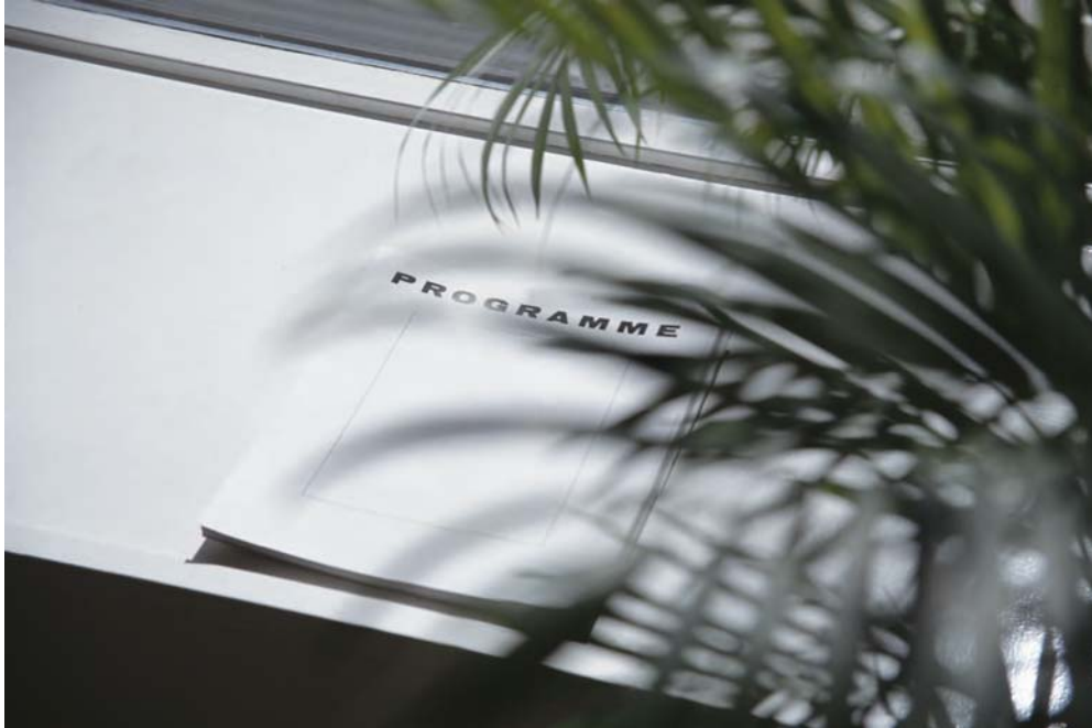
Figure 11. Pierre Huyghe. Le Procès du Temps Libre, 1999. Facsimile of a work by Marcel Broodthaers, figure 1 Programme, 1973.