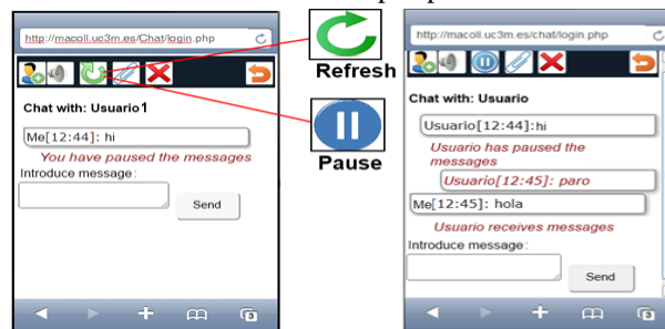
Fig. 1. Refresh/Pause Functionality

With regard to the Refresh Conversation , the user is able to control the flow and the rhythm of the conversation. If the user feels overwhelmed, he could pause the conversation by pressing the button Pause . The system informs the other users about it, they could write more sentences but the user who has stopped the conversation does not receive any sentence until he refreshes the conversation again. Then, these messages will be showed together. The Fig. 1 includes screenshots of the chat related with the “pause/refresh” functionality. The first figure shows the perspective of the user who stops the chat and the second one the perspective of the other user.