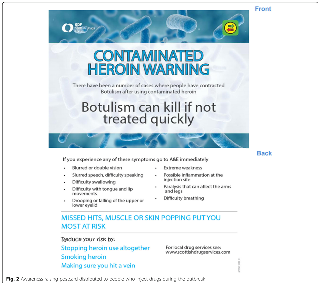
Fig. 2 Awareness-raising postcard distributed to people who inject drugs during the outbreak

suggests that it can attract and retain PWID in services [25] and therefore provide a vital window of opportunity to raise awareness of the outbreak and to filter harm reduction messages to those at ongoing risk.