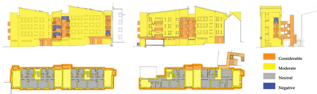
Figure 5. Example of colour-coded drawings in the conservation statement, illustrating the significance levels of different building elements and spaces of blocks 1 (left) and 2 (right) (Image © Simpson & Brown Architects)