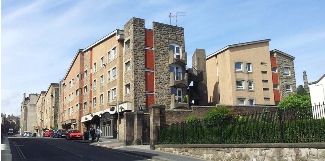
Figure 3. Photograph of the Canongate Housing complex along Canongate with blocks 2 and 3 in the foreground and external concrete stair between them