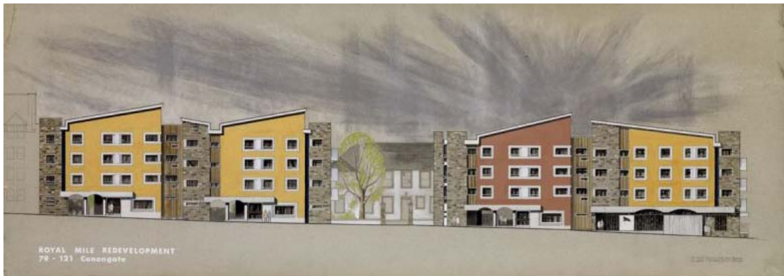
Figure 1. Coloured presentation drawing of by Sir Basil Spence, Glover & Ferguson, dating from ca. 1965, of the Canongate elevation, with Blocks 1 (left) and 2 (right) framing the set-back Manse building (in the centre)