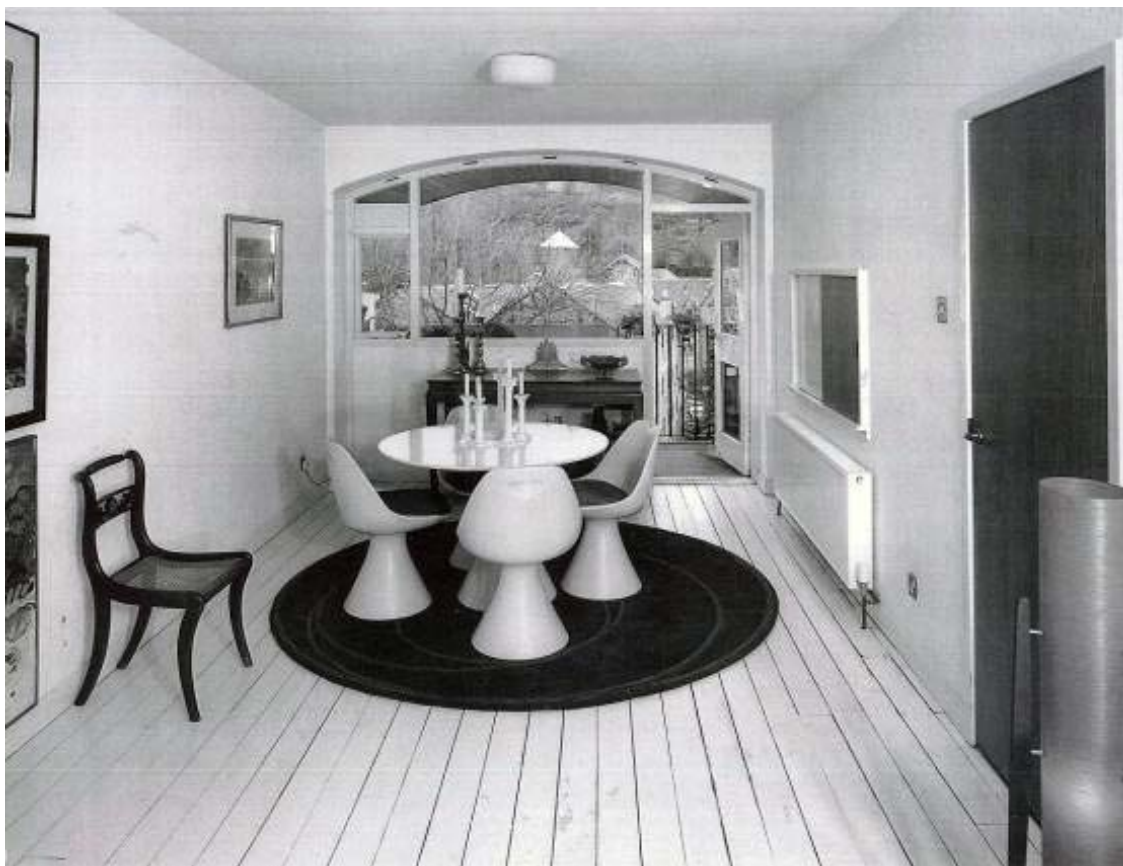
Figure 6. Photograph, taken in 2005, of the living room of a flat in block 2, with original door-window combination to balcony: Note the service hatch to the kitchen above the (non-original) radiator on the right of the photo.