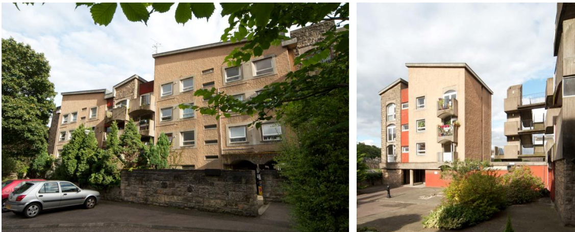
Figure 4. Photographs of rear elevations: The left photo shows the north-facing façade of block 1, the right photo the west-facing façade of block 3 with the external stair to block 2 on the right. (Image © Simpson & Brown Architects)