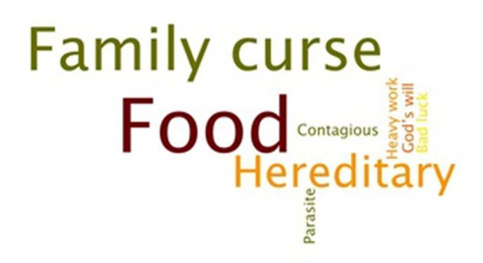
Figure 1a. Perceived causes of leprosy in leprosy cured individuals 88x51mm (96 x 96 DPI)