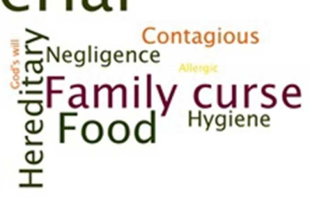
Figure 1b. Perceived causes of leprosy in health care professionals completing the questionnaire as if they were patients 88x51mm (96 x 96 DPI)