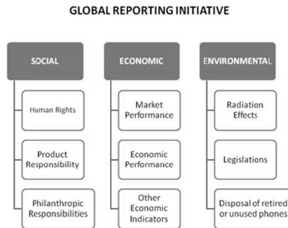
Figure1: GRI reporting (adapted from Rana et al., 2009)