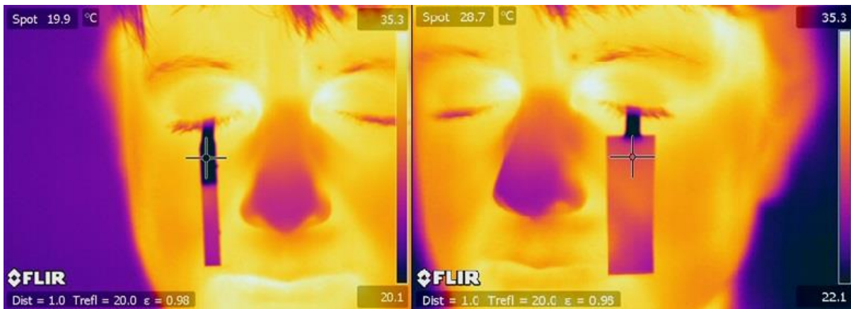
Figure 3(a): Infrared thermal imaging shows the wet portion of the Schirmer strip is colder than the dry portion of the strip at 5% relative humidity (temperature of spot = 19.9 °C), an environmental condition that was selected to best display this phenomenon. This change in temperature is due to evaporative cooling which occurs when water evaporates from the surface of the Schirmer strip during the test. Figure 3(b): Infrared thermal imaging shows that the sheathed portion of the Schirmer strip does not decrease in temperature due to evaporative cooling at 5%RH, as there is no evaporation occurring behind the plastic sheath (temperature of spot = 28.7 °C).

amount of surface evaporation from the strip ( Figure 3(b) ). This therefore reduces the amount of variation caused by environmental conditions, indicating that it may be possible to modify the Schirmer strip in order to overcome the effect of relative humidity. The authors hope that these findings may revitalise the Schirmer test, perhaps helping to ensure it remains a staple of dry eye diagnosis for another 100 years.