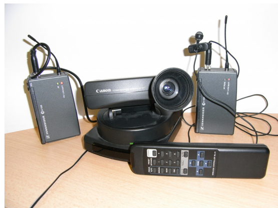
Figure 1. A typical capture station (note usually hidden in a cupboard), with a typical remote camera and radio microphone

This works well and is in use in many places. The key drawbacks are that again only a limited number of places are “wired” and demand for them is oversubscribed. Although management is less, there is still an operator cost hidden in the background management. However one of the key drawbacks is the costing model – although the equipment is bought outright, most of these operate on an annual “licence” basis, which can be too expensive for a