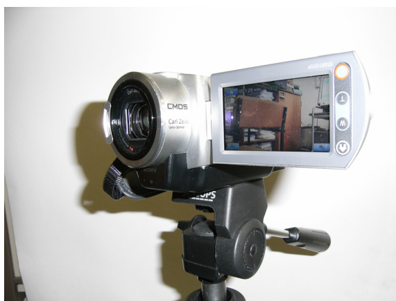
Figure 2. A typical digital camera set up for lecture capture

The quality and useability of camcorders has advanced in a quite staggering fashion, and with the limited quality (pixel count) required for podcasts these are easily good enough for the purpose.