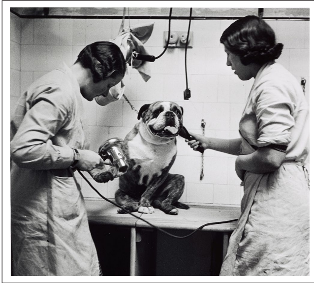
Figure 4. 'Poodle Parlour', London by Edith Tudor Hart. Silver gelatine print from archival negative National Galleries of Scotland. Archive presented by Wolfgang Suschitzky 2004. © Copyright held jointly by Peter Suschitzky, Julia Donat and Misha Donat.

society at odds with competitive egoism (Forbes, 2011). Gee Street was published (as 'London Backyard') in the widely selling 1939 Odham's Press collection of The World's Best Photographs and the commentary was a powerful statement of social realist photography: