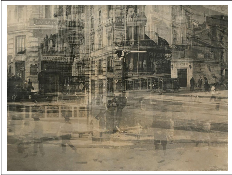
Figure 2. 'Moderner Verkehr im alten Rom' (1930) by Mario Bellusi (Modern Traffic in Ancient Rome) silver print 154x202mm. Mart, Archivio del '900, Fondo Somenzi. Catalogue number: Som.VI.11.18.

(Carrabine, 2012). The aesthetic is then a terrain through which meaning and judgement are contested and constructed, so that art is distinct from life but reveals its deeper layers. The photograph is not simply a 'trace' or a copy but a social form embedded in cultural modernity's shock and movement. Cultural modernity entailed increasing symbolization and abstraction, towards universalizing sameness, emptiness and anonymity, as opposed to individualization and differentiation. The visibility/invisibility of the metropolis is manifest in both socially-committed documentary photography with an aesthetic of shock (Dant and Gillock, 2002), and abstract styles of detachment and lines of shape and colour. While there was a fierce conflict between the abstract formalism of Neues Sehen and political social realism, both implied a utopian vision and echoed modernist cultural dilemmas. This section will explore these issues through the inter-war workers' photographic movement and the work of Edith Tudor Hart, who though more realist than new vision, aimed to challenge the way the world is perceived and embodied an aesthetic that transcended utility.