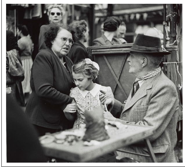
Figure 5. 'Caledonian Market' by Edith Tudor Hart. Silver gelatine print from archival negative. National Galleries of Scotland. Archive presented by Wolfgang Suschitzky 2004.