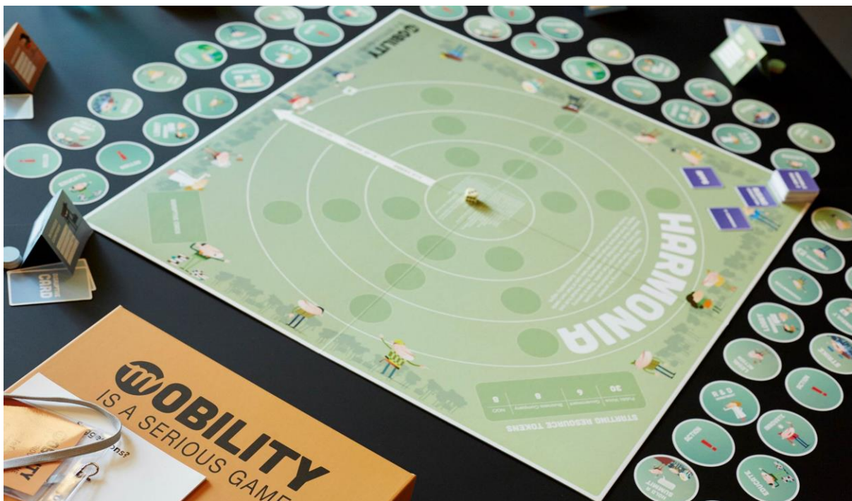
Figure 3: The "Harmonia" board for "Mobility is a serious game"

Challenges: simplification and shortening of the sessions