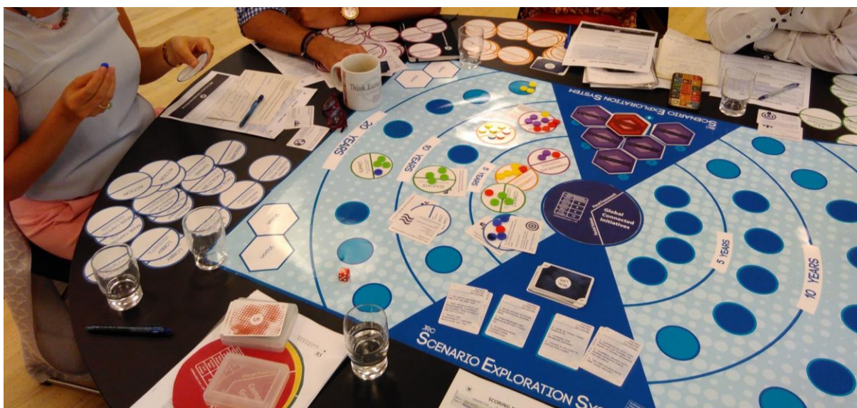
Figure 2: A scenario exploration in progress

The fact that the SES is based on future scenarios creates a safe space to simulate possible responses connected to any issue of interest to the participants. Its set up is a vast oversimplification of reality but it still provides enough complexity to challenge participants in a way that is usually perceived as realistic. Also, the fact that ' scenario explorers ' only have a limited amount of resources to spend over their complete exploration and can only take one action per round focusses minds and pushes them to set priorities and be strategic. Figure 2 (below) illustrates a scenario exploration in progress.