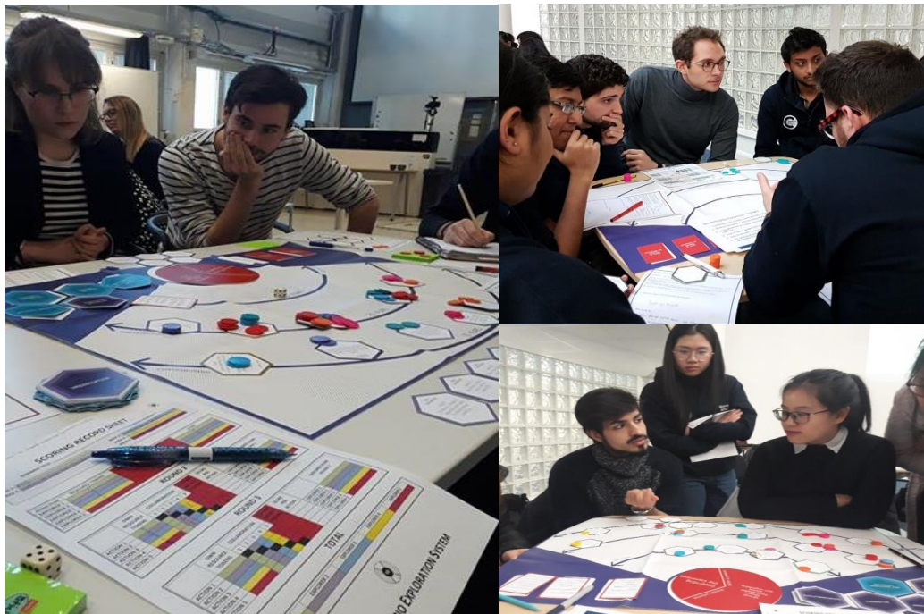
Figure 6: Master students exploring scenarios for sustainable businesses

about sustainability, but also offered examples and inspiration of how to apply sustainability in the multi-faceted social context of the real world.