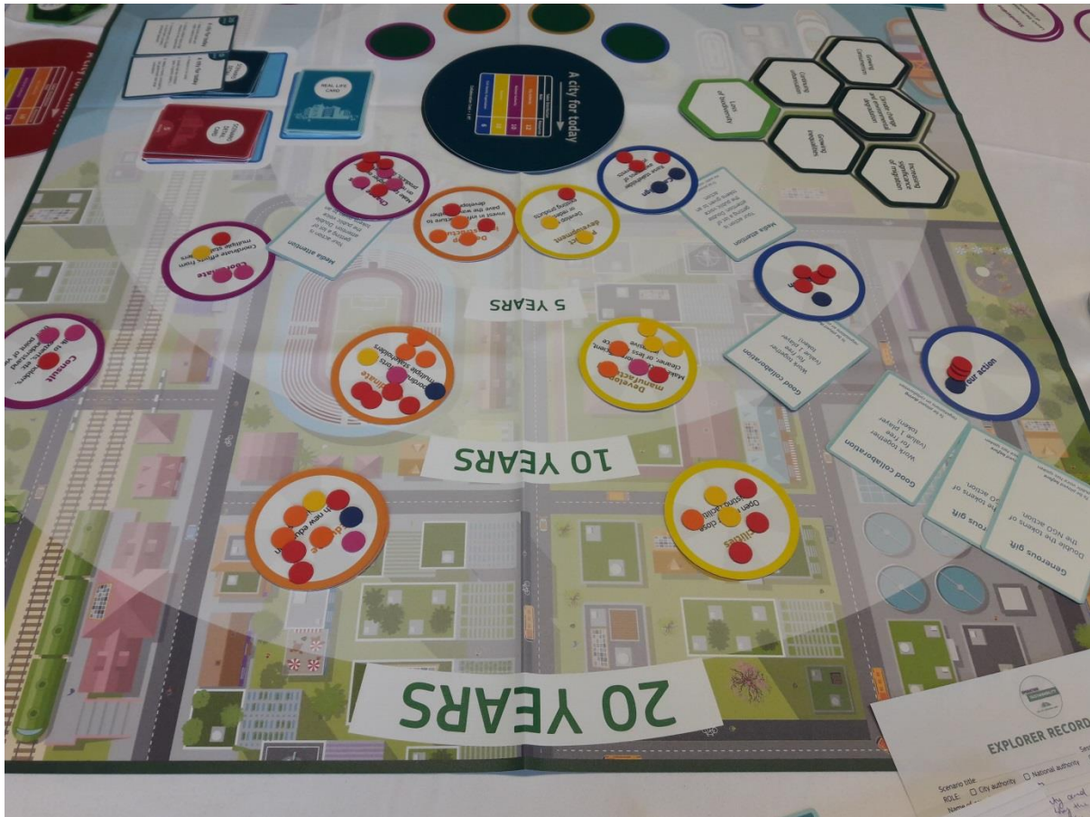
Figure 5: Illustration of the design applied to the "City Greening Game" edition of the Scenario Exploration System