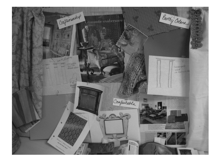
FIGURE 3. An example of a mood board for an interior design showing examples of the look and feel that is being sought.

including toys, models and various products. Pieces are collected and utilised either directly, or to aid thought in the design process. There is also a diversity of digital devices involved in accessing content, such as laptops, tablets and phones. Despite the presence of other computing devices in some of the studios visited, desktop computers still took a large and significant role in the design process and production of work.