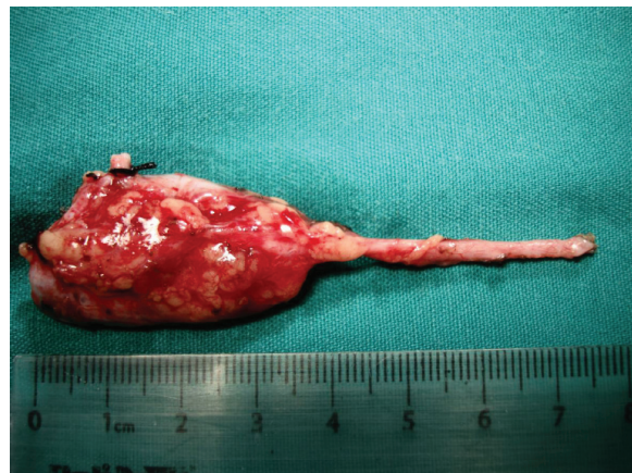
Figure 3: Surgical specimen showing the distal segment of the ectopic ureter draining into the right lateral wall of the upper third of the vagina.