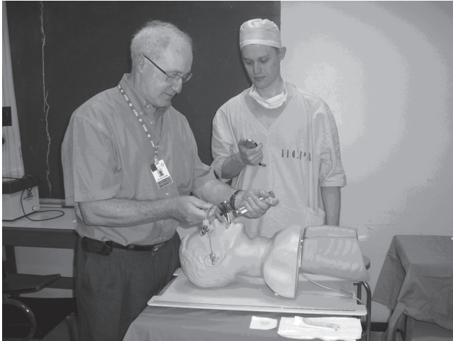
Figure 3 – The Procedure was Repeated 300 Times by Each Trainee, Who Alternated in the Tasks of Intubation, Chronometry, Data Recording, and Ventilation with the Balloon-Valve Device.

those in the literature since residents and anesthesiologists experienced in OTI were being evaluated. The probability of a type I ( \alpha ) and II ( \beta ) error was established at 0.1. The calculated sample size (number of OTIs) for an acceptable failure rate of 5% was 105 attempts. Using the data of the 300 OTIs, CUSUM curves were plotted for each trainee according to the formula in Chart I.