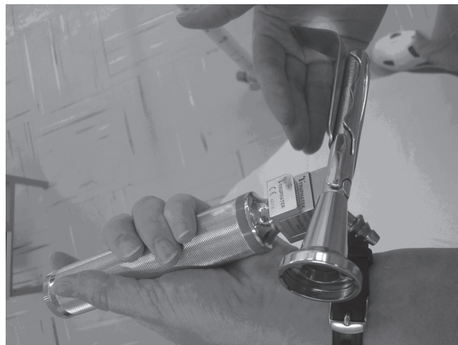
Figure 1 - Truview EVO2® Laryngoscope. Observe the optical piece connected to the blade. The visor allows the indirect view of the glottis by projecting the image reflected at a 42° angle. The visor can be connected to an endoscopy system, allowing projection on a video screen. The oxygen connector is located on the right, close to the optical visor.

The acceptable failure rate (p0) for OTI was 5% and the unacceptable failure rate (p1) was 10%. The acceptable and unacceptable failure rates established were stricter than