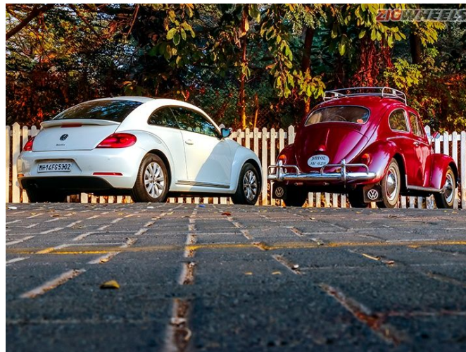
Figure 1: The Classic and the New Beetle

Both cars are shown in the following image: