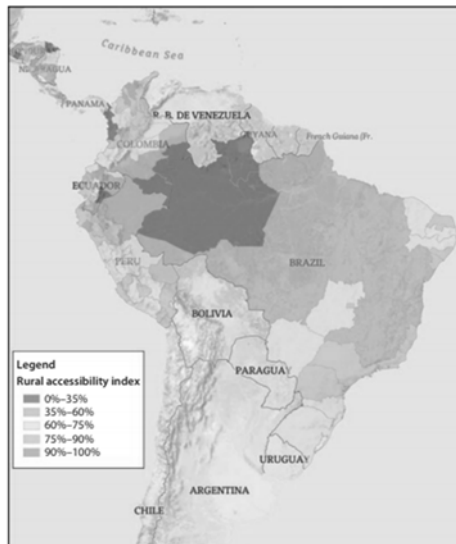
Figure 1: Representation of low population density and transport infrastructure in Latin America. Percentages of the rural population to 2 km of a road.

Thus, development in logistics and transport infrastructure is crucial when it comes to fostering trade and therefore the competitiveness of domestic products concerning international markets (BASSASSI et al., 2015). In this context, the northern region, besides being the one that has the lowest supply of highways, is the one with the worst conditions, with 81.1% of the extension classified in 2017 as regular, poor or very poor. The best result was obtained by the southeast region, with 14,260 km evaluated as excellent or good (48.5%). In the same classification, the central-west, south and northeast regions obtained: 65.4%, 61.7%, and 61.5%, respectively (CNT, 2017).