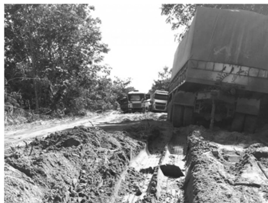
Figure 2: Photographic illustration of the traffic conditions in the Mato Grosso do Sul Highway that persist and generate a state of emergency in the full year of 2018.

The BR-364 Highway that has approximately 60.8 km is the main route to the transportation of products from the agribusiness and became impassable for approximately four months of the year. It occurs because being in its bed natural, highways constructed without meeting the road rules of geometric design, considerably increasing the transportation time traveled in this stretch, causing a significant increase in transport costs (Figure 2).