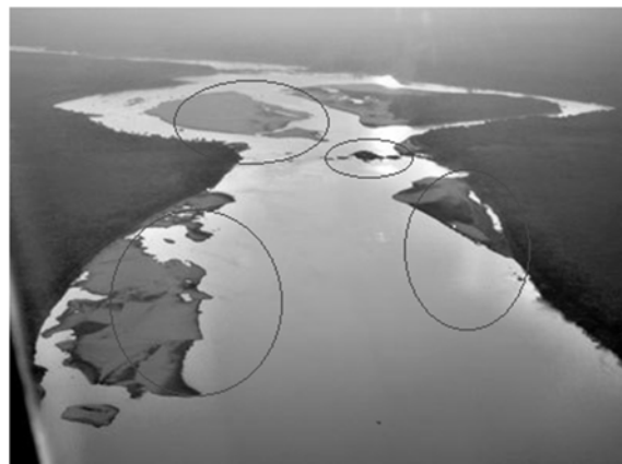
Figure 3: Navigation on the Madeira river is restricted between Porto Velho (Rondônia) and Humaitá (Amazonas)

It should also be noted that river transport has peculiar characteristics due to the period of low water that occurs from July to October. In this period the formation of sandbanks occurs, which alter the favorite navigation channel, which makes transport through large rafts impossible. Therefore, the only alternative is to use smaller-sized ferries, which requires a longer transport time, on average from 7 to 25 days, in addition to the reduction of the load capacity per ferry, which raises costs in the logistics process (Figure 3).