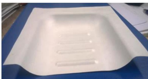
Figure 1. A sample of a tray with requirement of high extensibility.

Elongation is a key property for several packaging applications. The relationship between shrinkage and elongation of paper was investigated over a wide range, in order to understand and develop high extensibility for paper. The same dimensional contraction brought about by shrinkage can be strained out in tensile testing. However, percentage-wise the elongation is greater than the shrinkage due to different reference points, and the difference increases strongly at higher shrinkage levels. Elongation of paper can be explained mainly by two factors: the shrinkage and the net elongation of paper.