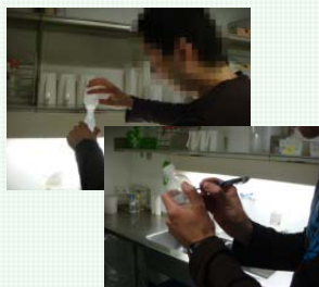
Above: A parent to an inpatient premature baby in the process of transferring the mother's breastmilk into an individualized receptacle for storage, and marking it for future identification before storing in the milk kitchen refrigerator.

professionals (see images below). The original scope and framing to re-design refrigeration units per se , were opened up through the collaboration to scrutinizing, but also leveraging, breast milk handling practices across the entirety of 'the journey' of the breast milk - the 'hands', the props, and situations, all which bear upon its handling. It broached more than what may reduced to patient safety in a clear-cut manner - and reframed the issue more conductively as manifold practices in many different situations of potential pertinence to quality in breast milk handling. Design materials issuing from this process allowed for actively