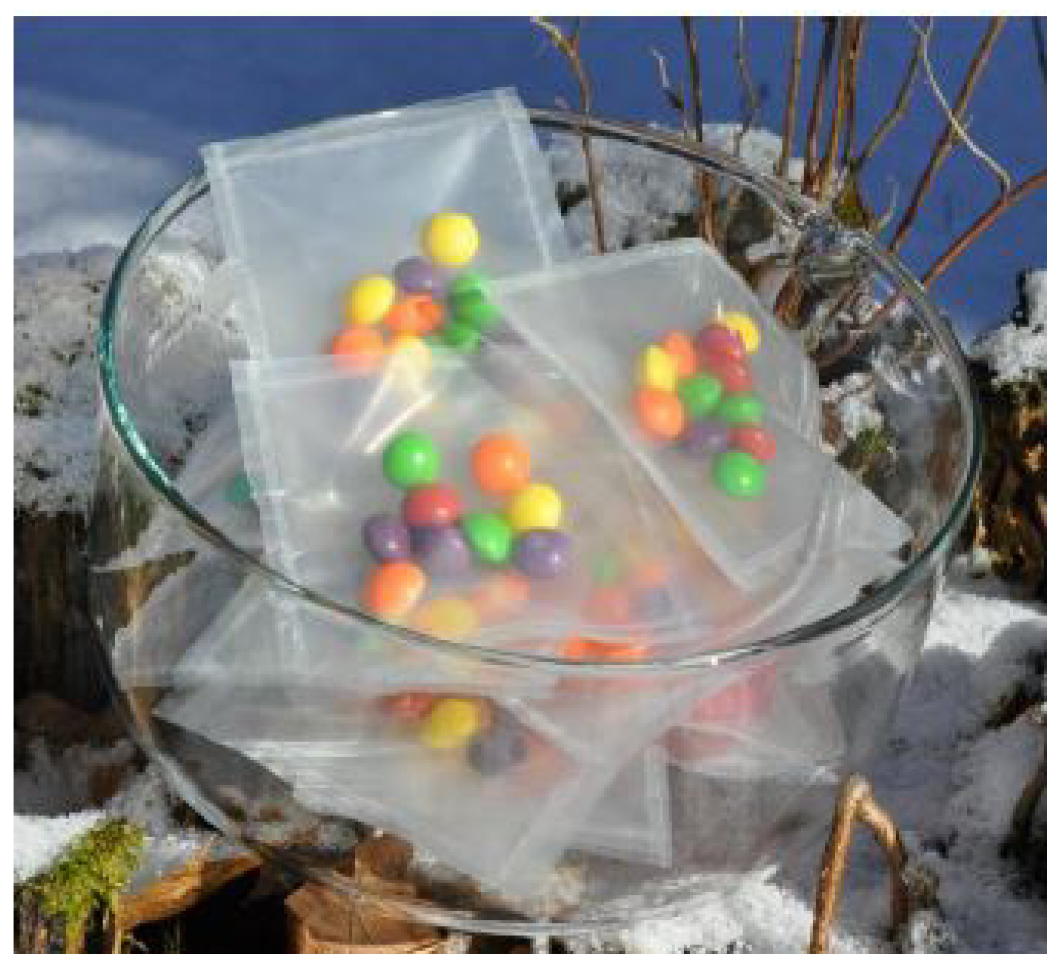
Figure 2. Three-layer cellulose film consisting of thermoplastic cellulose and HefCel CNF.

HefCel material has shown potential in many applications, such as in barrier films, as strengthening additive in middle ply of board and in novel type of energy storages. One novel application utilizing the excellent oxygen, grease and gas barrier properties of cellulose nanomaterial films is an all-cellulosic packaging material from HefCel and fatty acid esters. It is a 3-layer barrier film structure consisting of two layers of thermoplastic cellulose with a HefCel film layer sandwiched in-between. Thermoplastic cellulose films act as moisture and water vapour barrier as well as enables heat sealing. The material is 100% renewable, recyclable and processable with existing machinery (Figure 2).