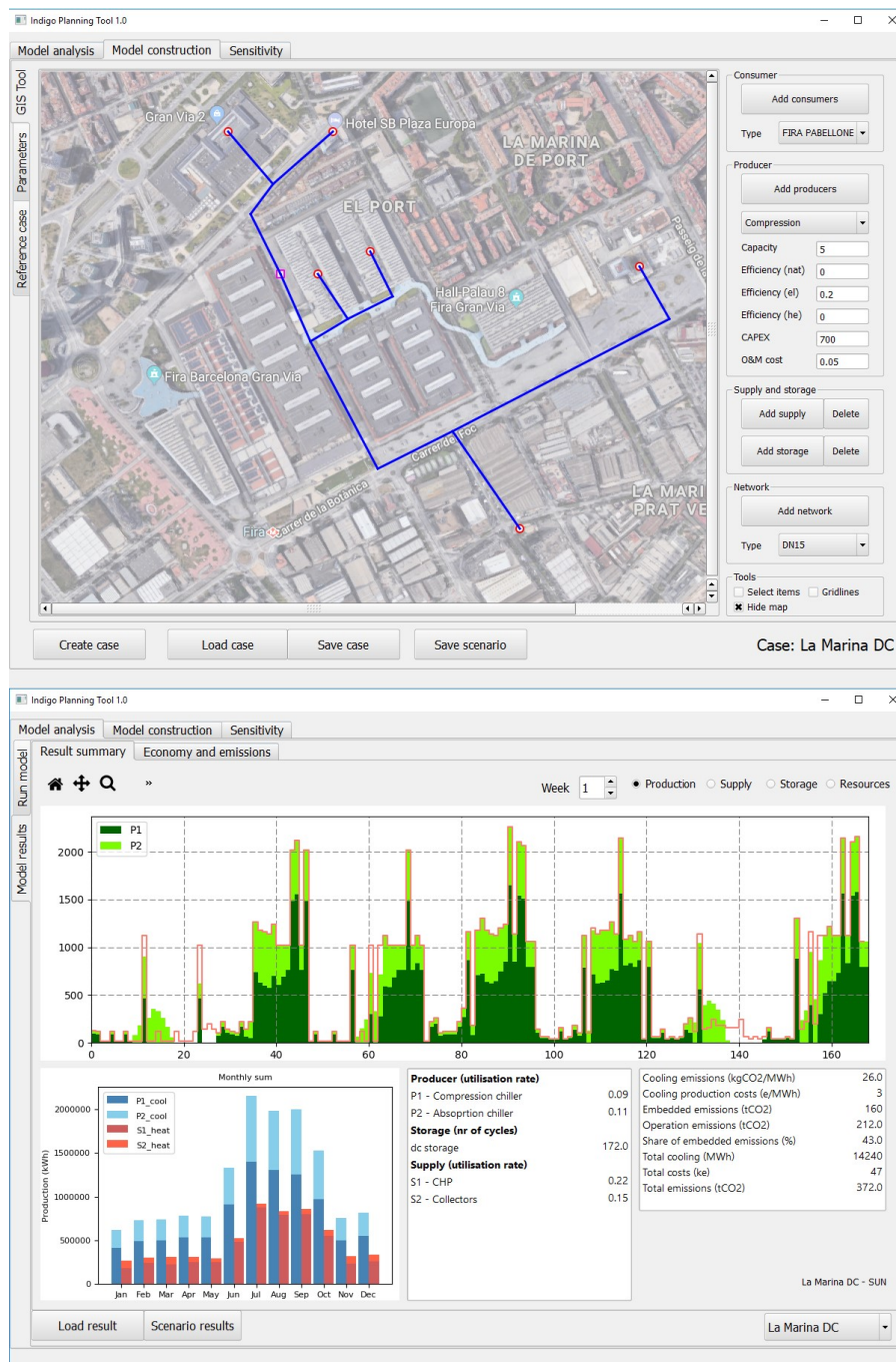
Figure 3. Examples from GUI of planning tool.

While the cooling system analysis is not detailed enough to be used directly in design process or e.g. to optimise the operation of a real, existing system, the results are highly useful in the planning process as input for feasibility studies.