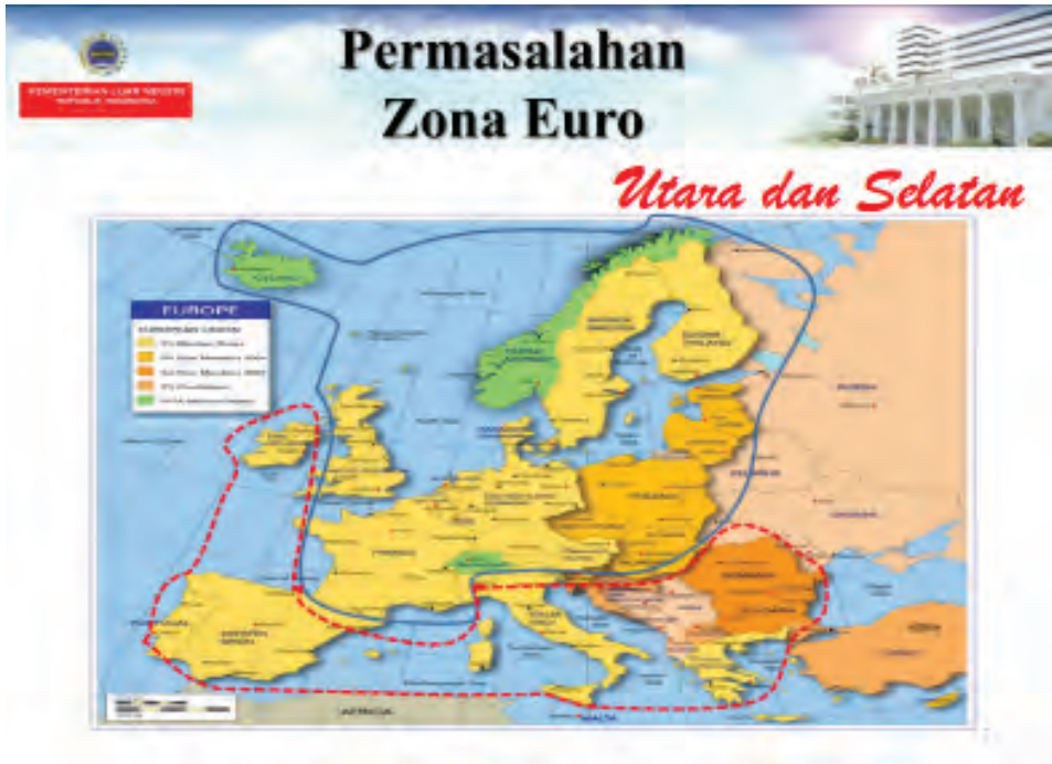
Figure 3: Euro Zone Issue - North and South