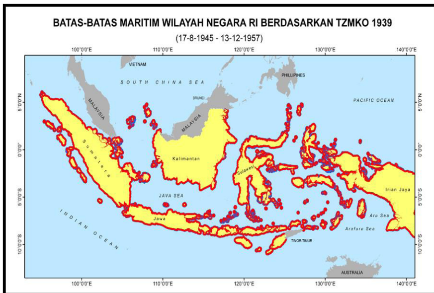
Figure 2. Illustrative Maps of the Indonesian Territory Based on the TZMKO 1939 68

Since some of Indonesia’s islands or groups of islands lay more than six miles apart, the three nautical miles territorial sea could not enclose the archipelago within a single jurisdiction. Consequently, each island had their own respective territorial waters and there was a gap between islands which consisted of high seas. As a result, the major part of Java, Banda, Maluku, and Natuna Seas which form the heart of the Indonesian archipelago, were considered high seas. 69