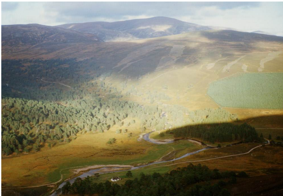
Derry Lodge: an interface between sporting, forestry and conservation management

52) Agricultural or sporting land management can have huge impacts on the vegetation and habitat quality over large areas, through increase or decrease in grazing pressures (deer and sheep) or practices such as muirburn. Fences are also a concern in that they both restrict movement of people and wild animals and provide often unwelcome visible evidence of human activity. Forestry has also contributed to landscape change through block plantations of non-native species in areas where they did not previously exist and has further implications for wild land through creation of forest roads. More recent developments in forest strategies emphasise native woodland species recovery and tree line afforestation, both of which might be seen as having remediating effects.