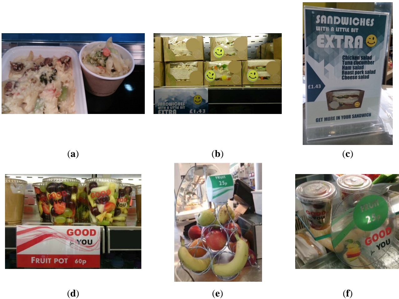
Figure 1. Some of the nudge strategies implemented for designated food items during the intervention: (a) disposable pots for freshly prepared vegetarian daily specials; (b) stickers on sandwiches containing salad; (c) poster promoting sandwiches containing salad; (d) stickers and end of shelf labels for fruit pots; (e) pyramid display stand holding whole fruit; and (f) window sticker promoting whole fruit.