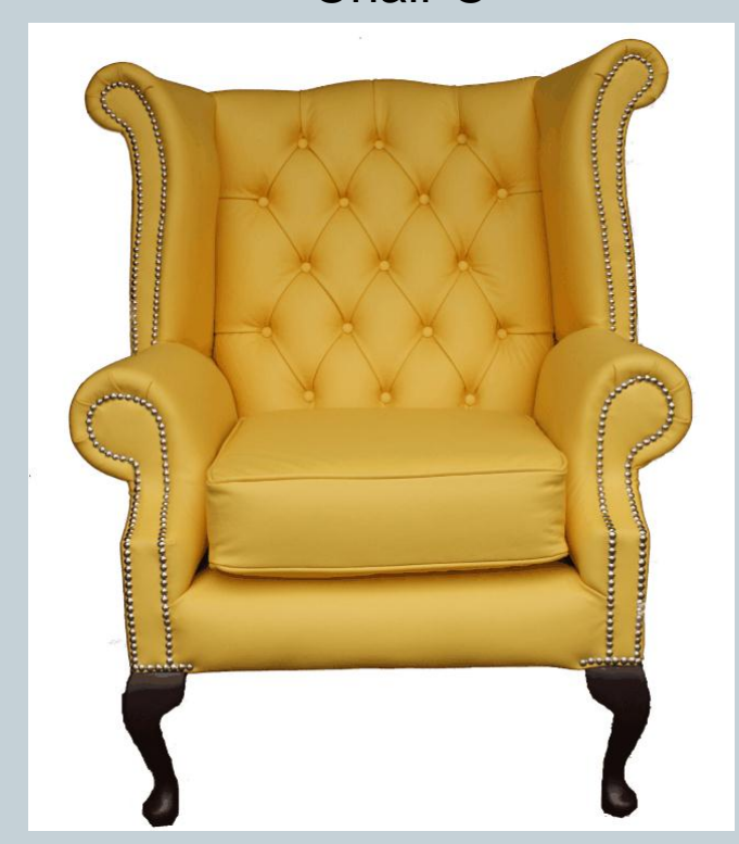
"Chair C is yellow"