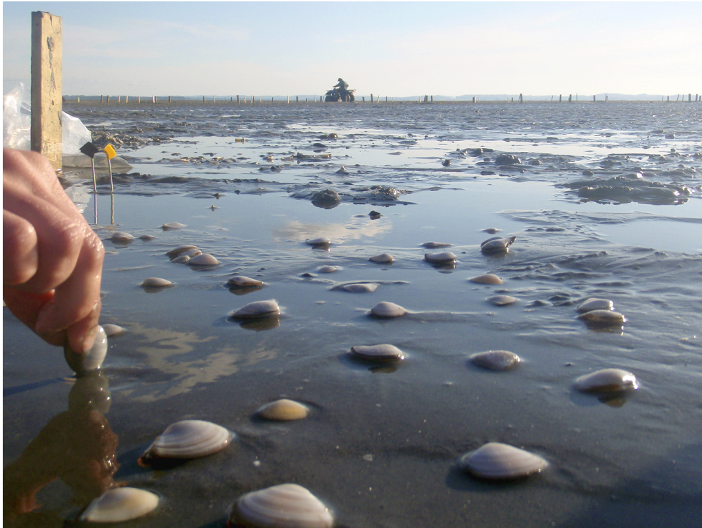
PLATE 1. Outplanting Macomona in one of the experimental plots on the sandflat (Wiroa Island, New Zealand).

standard operating procedure for marine sediments on a Malvern mastersizer-S (300 FR lens; Malvern Instruments, Malvern, UK) to determine grain size fractions in the range of 0.05–2000 \mu\text{m} .