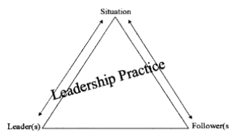
Figure 1. Constituting elements of leadership practice.

I wish to include the diagram on page 11 in my Chapter Two: Literature Review. I am using this concept model as a lens for my research on distributed leadership.