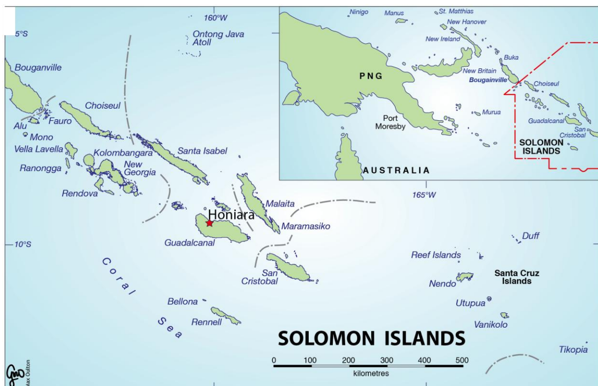
Figure 1: The Solomon Islands

With just 0.8 percent of its global natal population living overseas, the Solomon Islands (Figure 1), a Pacific archipelago, ranks 138th in the world for diaspora formation as a proportion of population: a total of less than 4500 persons within a population just under 600,000 in 2013 (Bedford et al. 2014). At these levels, the scale of the diaspora as a proportion of population remains much lower than it was in the early 20th century, when 5,000 Solomon Islanders living and working in Queensland were compulsorily repatriated under early 'White Australia' legislation (Corris 1972). Compared to island states in the northern and eastern Pacific, the small diaspora is exceptional when compared with over 50% of Samoans and 85% of Cook Islanders living offshore (Lilomaiva-Doktor 2009, Cook Islands Government 2012).